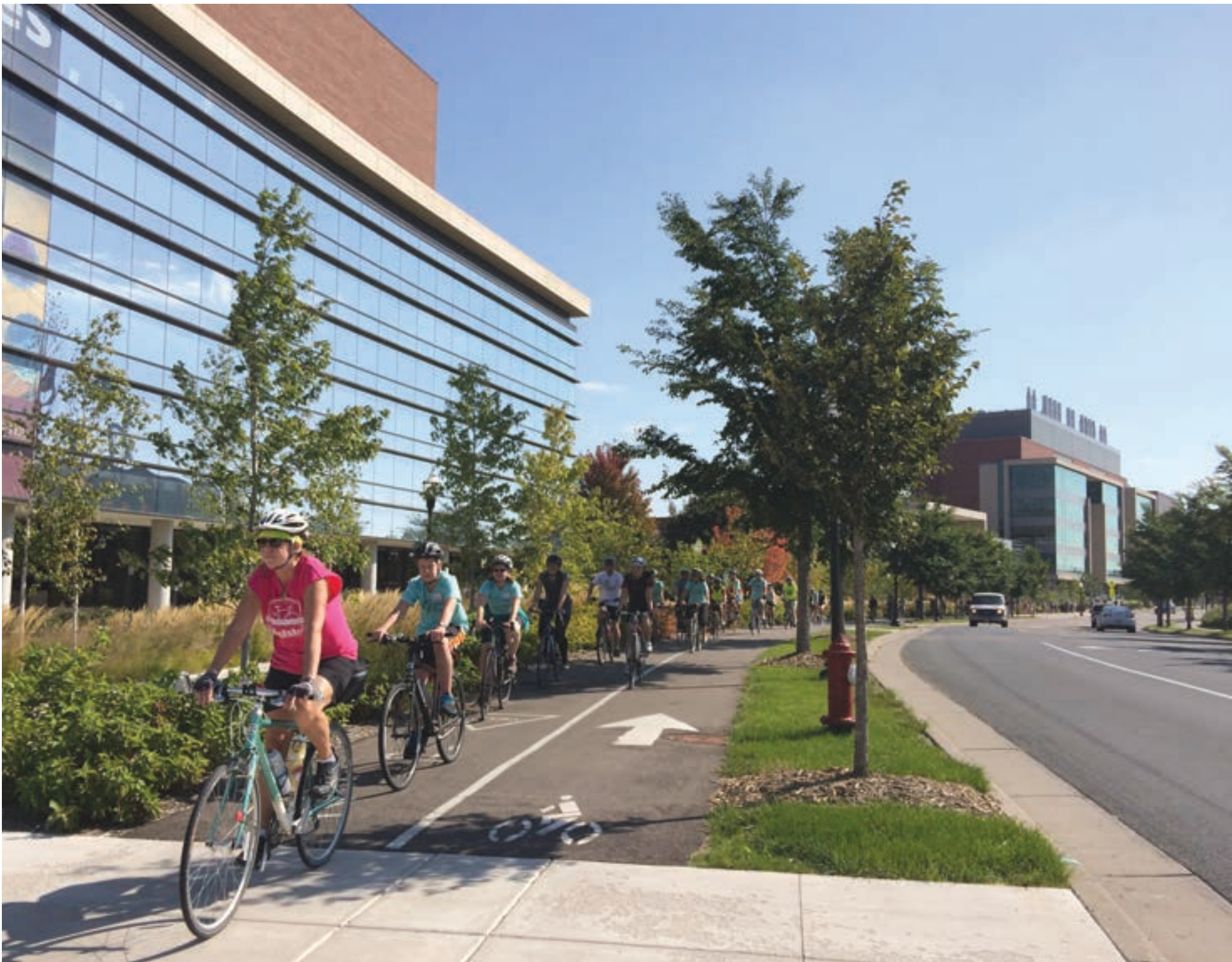
The protected bikeway along 6th St. SE