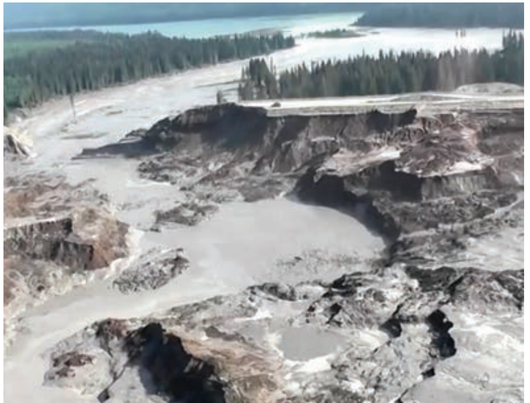
Mt. Polley tailings breach in British Columbia, August 2014

A tailings basin breach like that at Mt. Polley could be repeated at the proposed PolyMet sulfide mine site. In 2005, PolyMet purchased the crushing facility and tailings basin of the former (bankrupt) Erie and LTV taconite plant. The tailings basin is currently leaking 2.9 million gallons per day of contaminated water into the St. Louis River watershed. The current leakage is already in violation of water quality discharge permits.