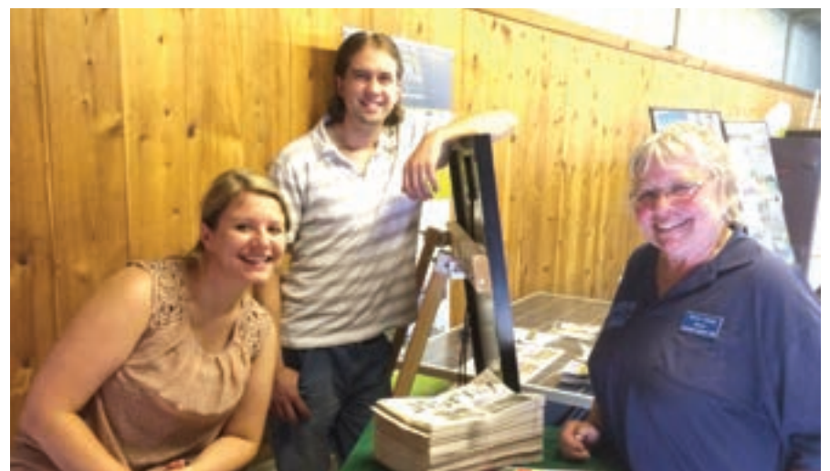
Sierra Club volunteers collected clean energy pledges at the Olmsted County Fair.

Now, the Mayo Clinic expansion and the Destination Medical Center (DMC) plan provide a unique opportunity to influence a multi-billion dollar development effort, and ensure that the project – which could bring $6 billion of investment