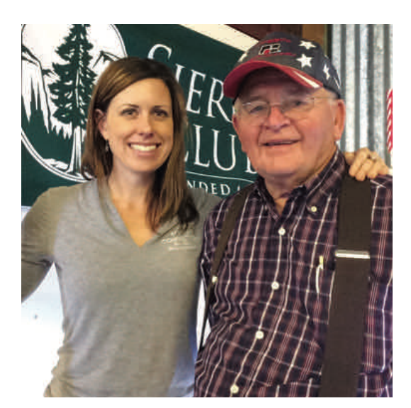
Sierra Club volunteers reach out at the Olmsted County Fair in July

With major new development planned for downtown Rochester as part of the Destination Medical Center (DMC), with the RPU survey results, with the coming adoption of a new Comprehensive Plan and Energy Action Plan -opportunities for changing "business as usual" in Rochester are many.