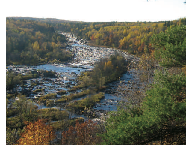
St. Louis River