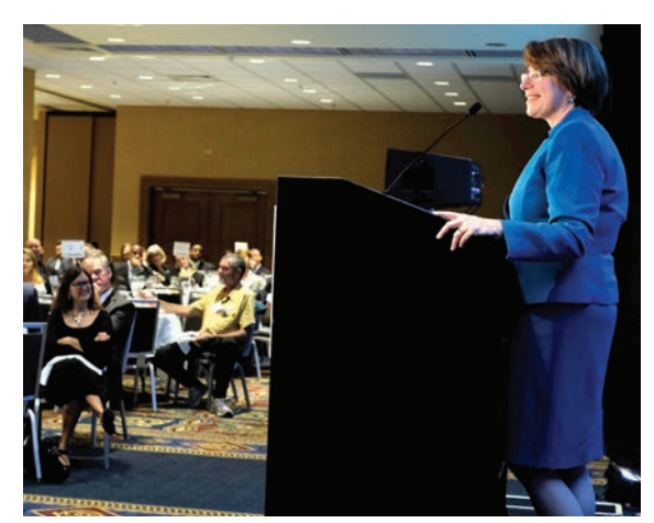
Senator Klobuchar addresses the crowd.

The North Star Chapter is an active member of the Minnesota BlueGreen Alliance Steering Committee, where we work with labor and environmental partners to create good jobs, a clean environment, and a fair and thriving economy.