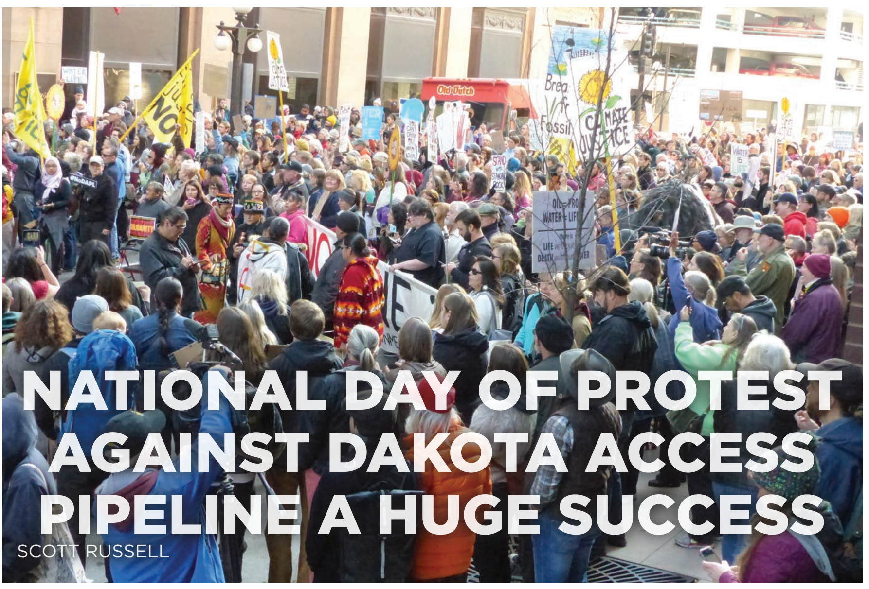
November 15 rally in front of the U.S. Army Corps of Engineers headquarters in downtown St. Paul

Hundreds of people opposed to the Dakota Access Pipeline (DAPL) gathered in downtown St. Paul on November 15, calling on President Obama to do everything in his power to permanently reject the Dakota Access Pipeline (DAPL). The St. Paul rally was part of a National Day of Action against DAPL, joining more than 200 similar rallies around the country, from Los Angeles and Denver to Manhattan and the White House