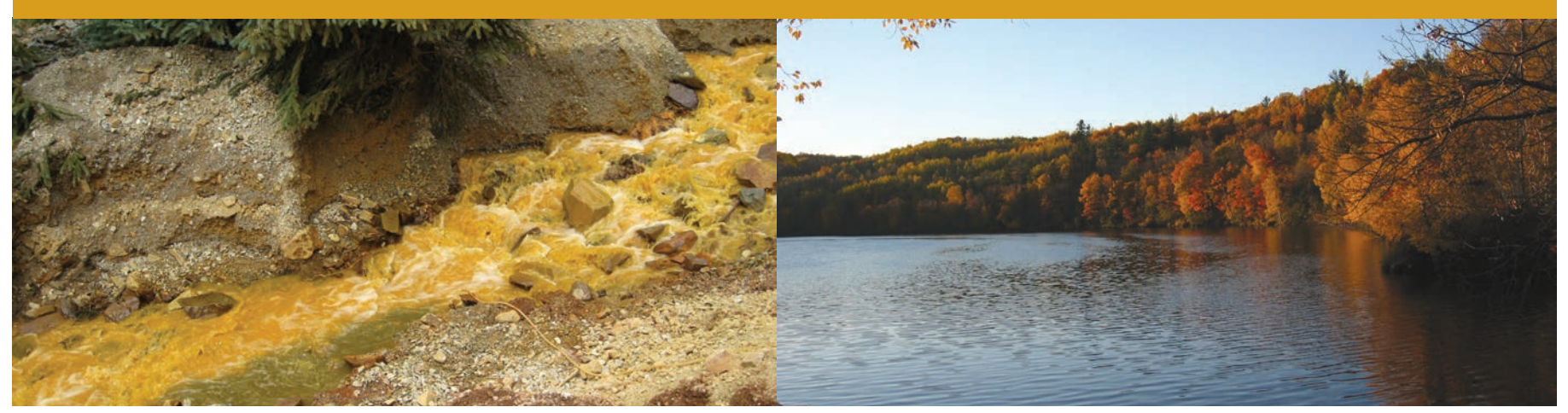
The Gold King Mine disaster in 2015 caused a plume of toxic mine waste to empty into the Animas River in Colorado