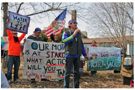
Duluth

Nearly 700 people joined the Duluth People's Climate March from Leif Erikson Park, along the Lakewalk to Lake Place Park on April 29. Local organizers from the Sierra Club Clean Energy Team and Minnesota Interfaith Power & Light invited local environmental and social organizations among them