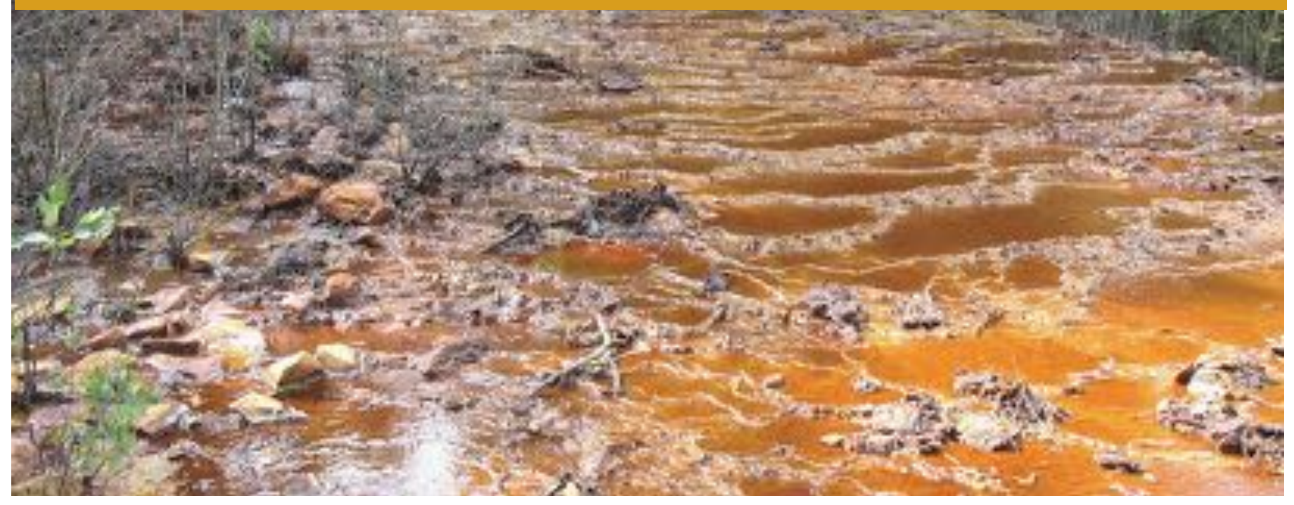
Acid Mine Drainage in a stream

On March 27, 2017, the Sierra Club joined with Save Our Sky Blue Waters and the Save Lake Superior Association in filing legal action against the U.S. Forest Service (USFS) land exchange with PolyMet.