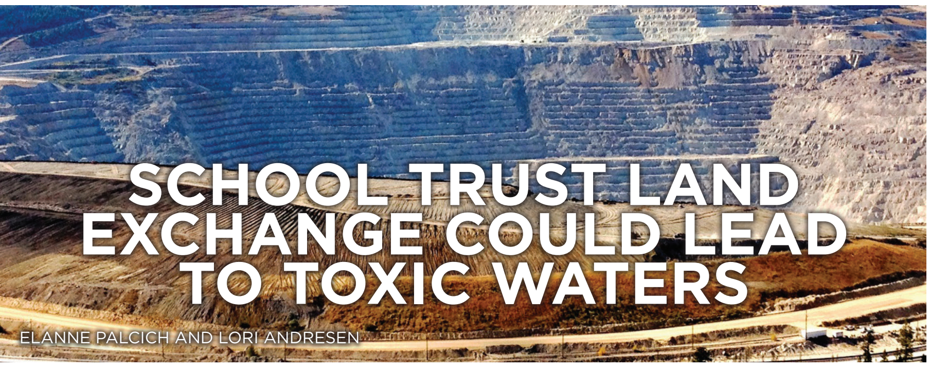
Example of a Teck Resources copper mine in British Columbia. This could be coming to Superior National Forest, based on Teck's known deposits.

Toxic copper-nickel sulfide mining continues to threaten Superior National Forest (SNF). The United States Forest Service (USFS), already planning a land exchange with PolyMet for its proposed toxic open pit sulfide mine, now plans to trade additional acreage that would facilitate more such mining. Only now it's being done in the name of our school children.