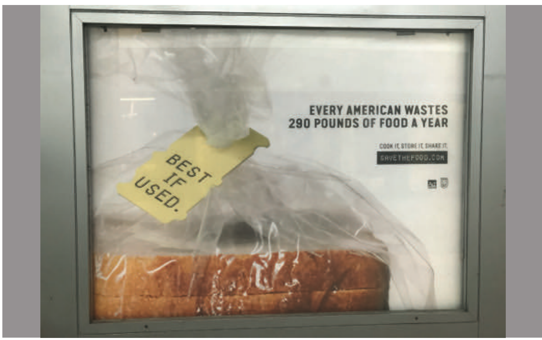
Photo description: Metro Transit ad for SavetheFood.com, Minneapolis