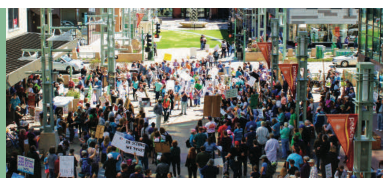
Rochesterites gather in the Peace Plaza for the city's largest ever People's Climate March.

2017 has been a year of firsts for energy policy in Rochester, and the Sierra Club has been in the thick of it each step of the way. The year began in the most exciting way possible – with city budget discussions. After months of building mounting pressure on the Destination Medical Center's (DMC) economic development agency, its board created a new sustainability director position. The city government was so convinced by the case for sustainability staff for the DMC that they gave additional funding so the position would also work on making