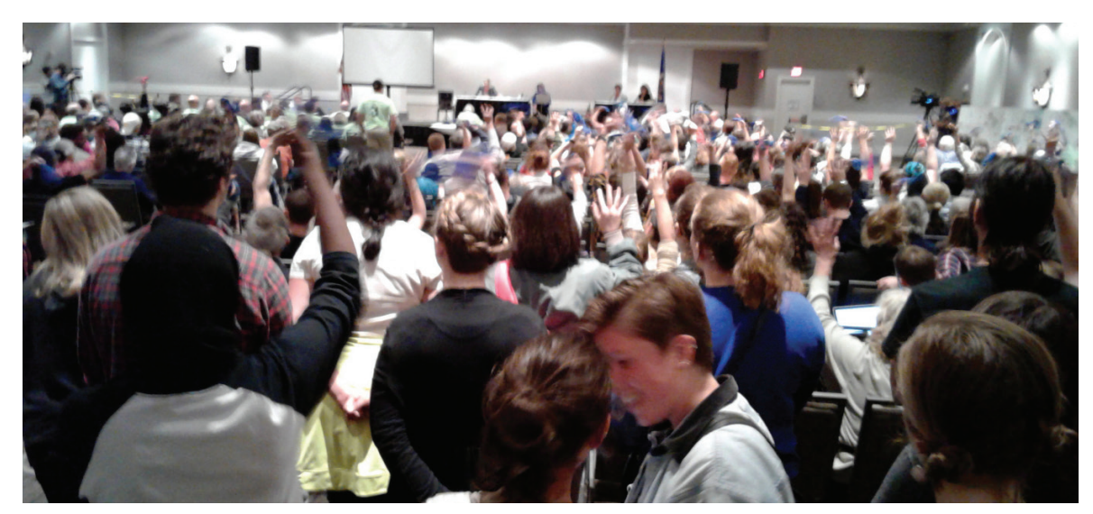
Those seeking to stop Line 3 greatly outnumbered supporters at a Sept. 28 public hearing in downtown St. Paul.

Things are coming to a head around the Enbridge Line 3 tar sands pipeline.