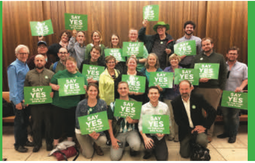
Ford Site proponents celebrate over a decade of advocacy.

In 2011 Ford Motor Company closed their Twin Cities Assembly Plant that had operated in the Highland Park neighborhood of Saint Paul since 1925. The 135 acres left vacant by the plant presented Saint Paul with one of the largest undeveloped sites in the metro region—and a huge opportunity. The land borders the Mississippi River and a thriving neighborhood, is well connected to the Twin Cities through an improving transit system and a strong network of bicycle facilities, and offers immense potential for housing, jobs and recreation.