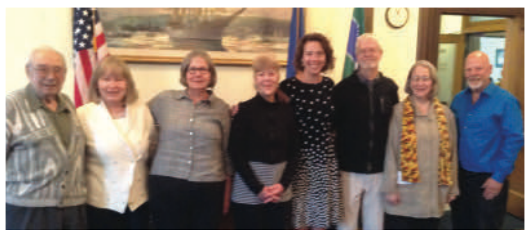
Duluth Energy Team met with Mayor Emily Larson to discuss the city's clean energy future.

Northern Minnesota Sierra Club Clean Energy Team members have been busy throughout the summer and fall working to promote clean energy, air and water. Several members of the Duluth Sierra Club team joined with other environmental groups including Minnesota Interfaith Power and Light, Ecolibrium 3, Citizens Climate Lobby, Izaak Walton League, McCabe Chapter, and Honor the Earth to work with on the City of Duluth's Comprehensive Planning 2035 process. The plan supports a city adoption of the greenhouse gas emission reductions proposed by Mayor Emily Larson in 2017 and also included in the Paris Climate Accord: 15% GHG reduction by 2020 and 80% reduction by 2050. Several members met with Mayor Larson in June to present Sierra Club's 100% renewable energy cities campaign (see photo).