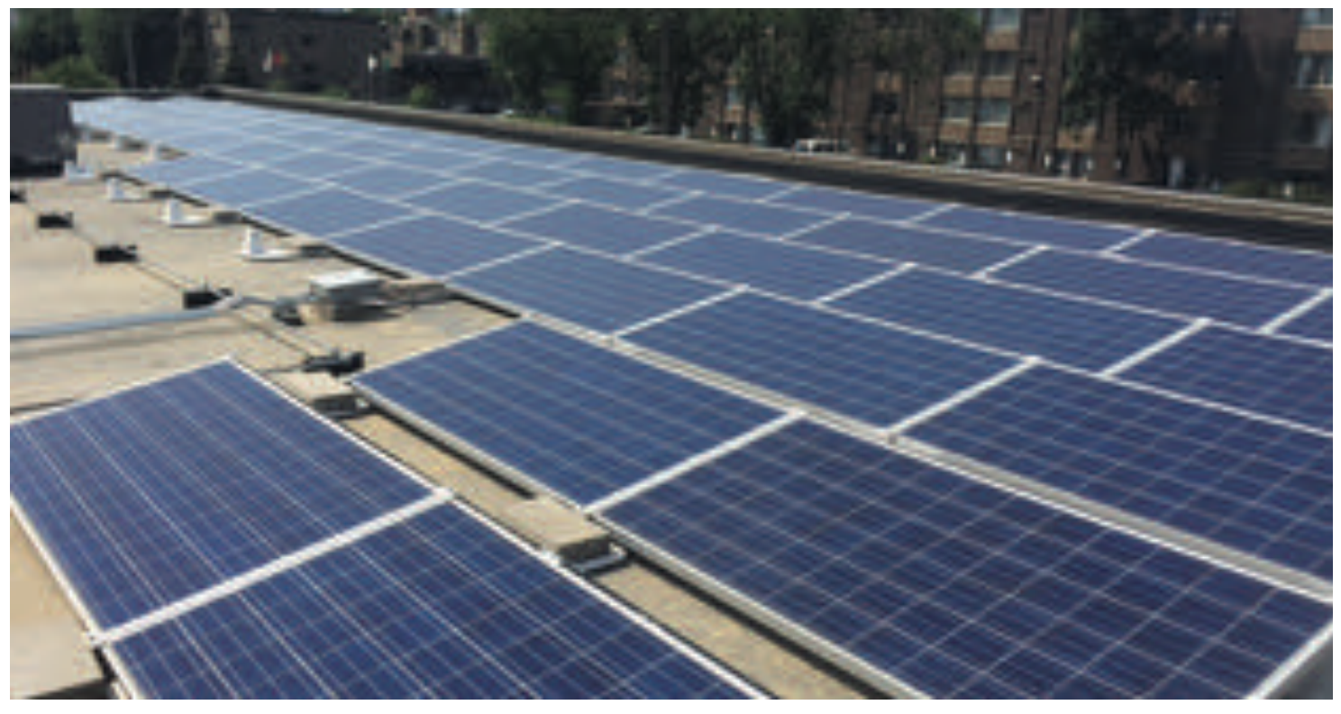
Solar panels above the Sierra Club office.

Solar energy: clean, abundant, free. On an individual level, property owners could—in theory—liberate themselves from dependence on fossil fuels by devoting sun-drenched square footage to a solar array.