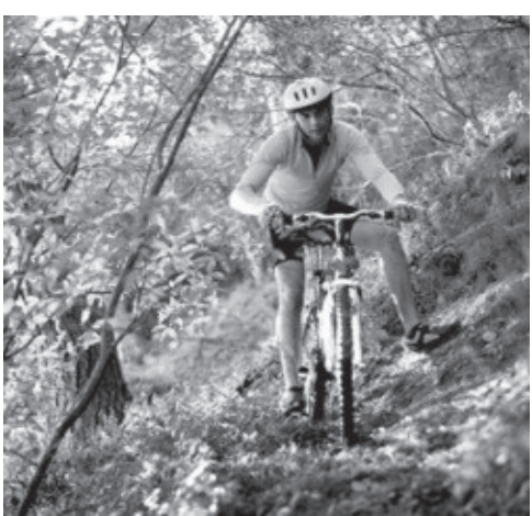
Consider bike riding as a healthy alternative to traveling by car!