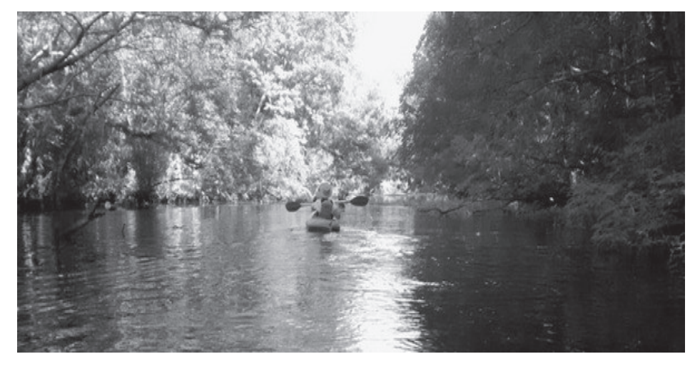
Sierra Club Members Kayak Deep Creek on April 11, 2015

We'll bike 14 miles of the island's trail system on Saturday, kayak 4 miles on Clam Creek on Sunday, and hike 6 miles, on Sunday. Make your reservation promptly to ensure you can reserve a site! We are staying at site J-01 Fri-Sun nights. This link will take you to the campground's site map: http://tinyurl.com/kal89a8 a specific site online. The fee for camping is $35 per night, plus $6 to enter the island; oversized vehicles are $10. In addition to signing up on meetup.com, contact the campground for your actual reservation, Here is a link to the campground website: http://tinyurl.com/lhgw7g9..You MUST wear a life jacket/PFD on the kayak outing and a helmet on the bike outing. Bring a hat, bug spray, sunscreen and sunglasses. RSVP on Meetup.com (Sierra Club Northeast Florida) or with Outing Leader Ken Fisher at 904-210-7765 or kpf1965@gmail.com.