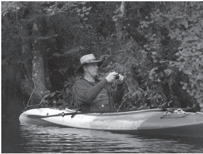
An adventurous Sierra Club Member pauses to capture the remarkable scenery on our recent kayak trip down Peters Creek in Green Cove Springs.