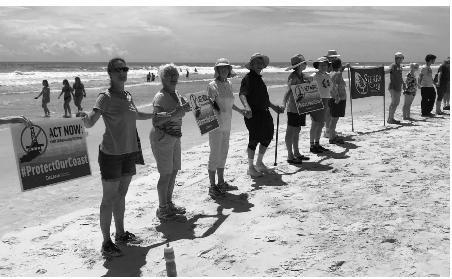
Sierra Club members show their support at the Jacksonville Beach<br/>demonstration.

There are the usual things: bring your own bags when shopping and shun the plastic; (continued on page 2)