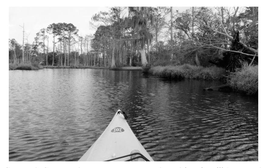
Goodbye's Creek during a club paddle last winter

available for rental at the park for $5 per hour; they must be reserved in advance by calling 904-794-0997.