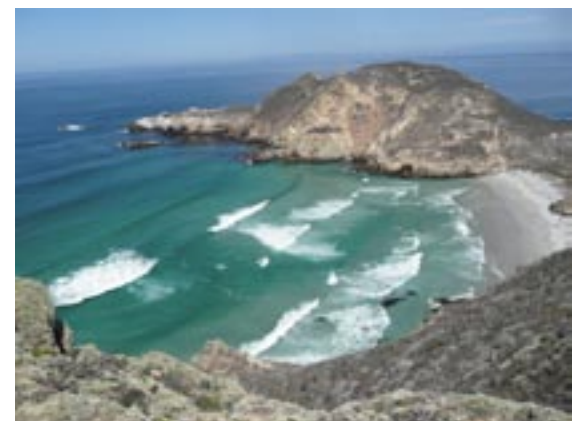
Wave action, San Miguel Island