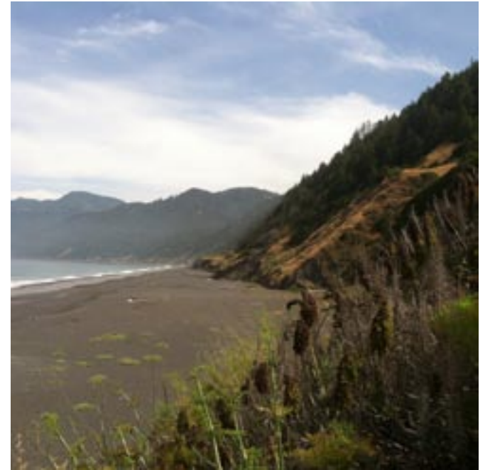
Black Sands Beach at Shelter Cove, King Range National Conservation Area.