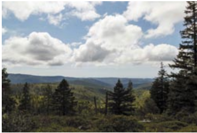
April 25 hike on Little Bald Hills Trail (Smith River NRA to Jed. Smith SP.) Leader: Melinda Groom.

Take advantage of a rare opportunity to experience the seasonal Green Valley Falls, located on land accessible only with special permission. Trail is over uneven ground, mostly level, but with a steep 500' elevation gain