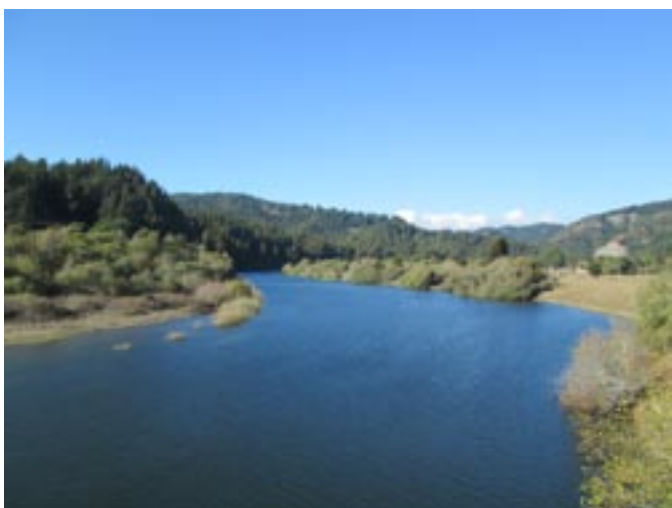
The Russian River near Duncans Mills.

“Water and Wine with Rue” continued on page 3