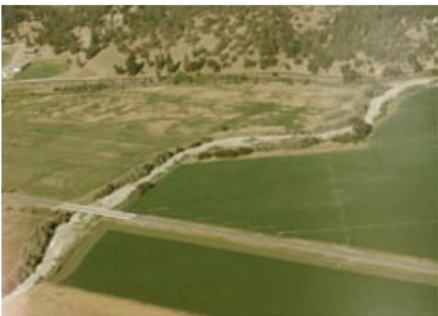
The Scott River is now dewatered even in years of “average” precipitation as a result of unregulated groundwater extraction for irrigation.

As groundwater planning to comply with the 2014 Sustainable Groundwater Management Act gets underway in high and moderate priority basins across California, a new threat to stream ecosystems has emerged. Known as “Replenishment” water planners believe that declining groundwater levels and related land subsidence due to over-extraction of groundwater (mostly for irrigation) can be reversed by diverting high winter and springtime streamflow to groundwater storage. The State Water Resources Board has already funded projects ( https://www.waterboards.ca.gov/waterrights/water_issues/programs/applications/groundwater_recharge/ ) to divert high flows to replenish groundwater, including in a major Klamath River tributary, the Scott River Basin.