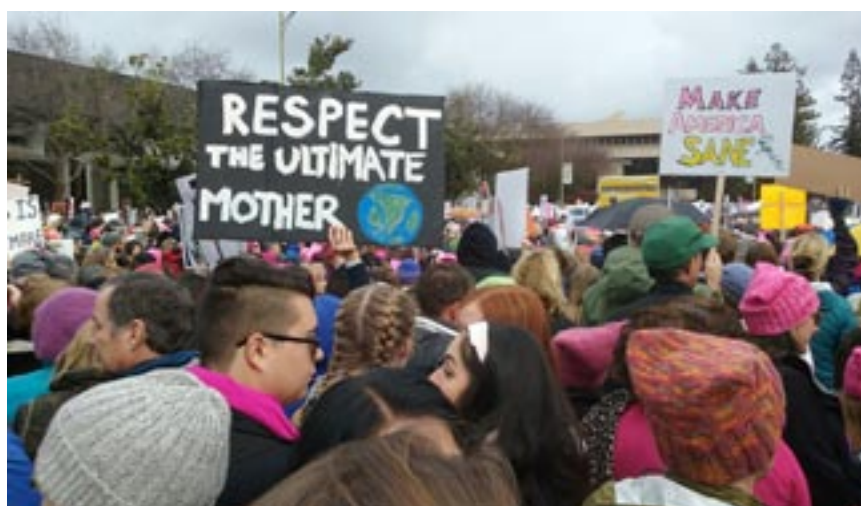
Rallying in Santa Rosa on Saturday, January 21st for justice and equality.

Enclose a check and mail to: Sierra Club, PO Box 421041 Palm Coast, FL 32142-1041 or visit our website: www.sierraclub.org