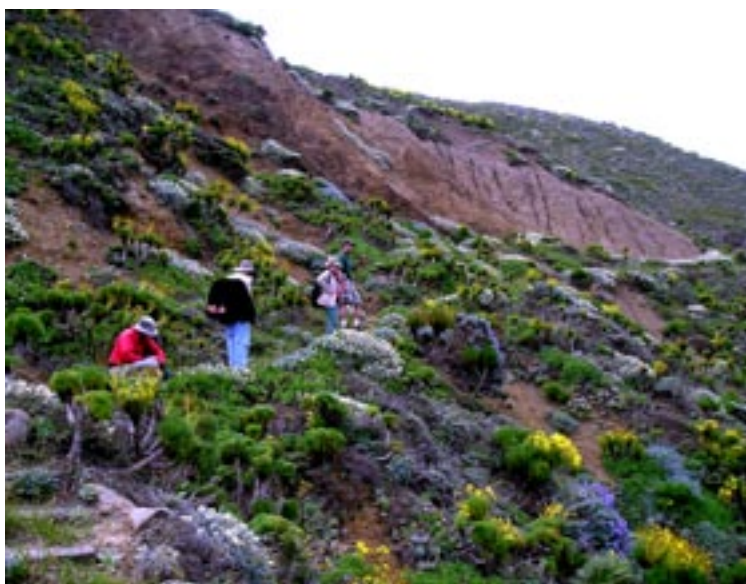
Hiking San Miguel Island