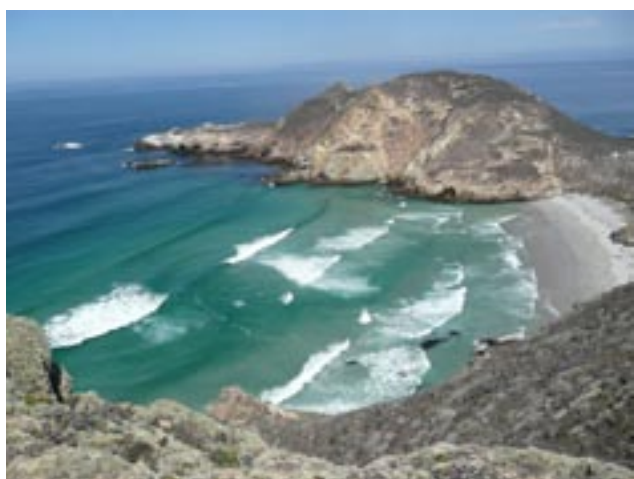
Wave action, San Miguel Island