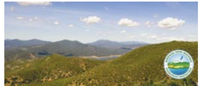
Scouting out the true fragrance of Berryessa Snow Mountain on Walker Ridge.

Quite the contrary: although Presidential action is expected soon and the champagne is on ice (metaphorically speaking, at least), we're still actively seeking endorsements from local governments, businesses, landowners, and anyone who loves this remarkable landscape. Assembly Joint Resolution 4, sponsored by Assemblymember Bill Dodd with the strong support of Redwood Chapter's other state legislators, passed in early April and was transmitted to the White House: this is the first time—ever!—that any state legislature has formally endorsed a proposed national monument. The most recent new supporters include the cities of American Canyon, Calistoga and Napa all of whom voted unanimously to support monument designation; at press time, a presentation before the Clearlake City Council (which passed a resolution of support for a National Conservation Area more than five years ago) was being agendized. Please check out the full support list at berryessasnountain.org —and if you don't see your own name, take a moment to sign a digital postcard of