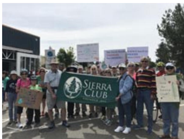
Sonoma Group Members marching for science