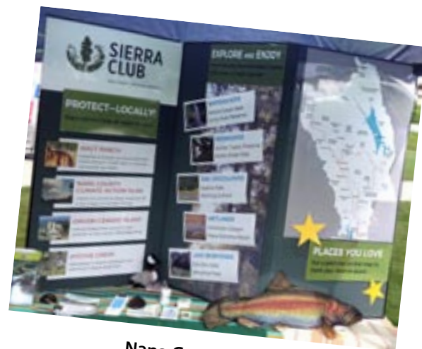
Napa Group display