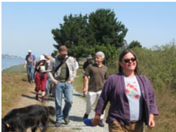
Attendees walk the loop trail following the dedication ceremony.