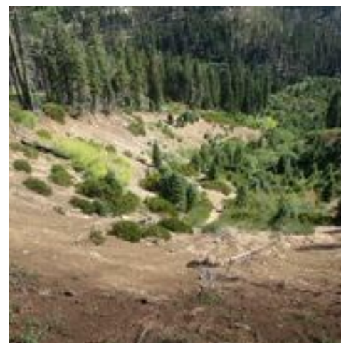
This large landslide in the Trinity Alps Wilderness was triggered by a Forest Service burn-out. It delivered a massive amount of sediment to New River which is one of the few streams still supporting Summer Steelhead.