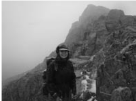
Crossing Pinchot Pass in surprise sunrise snowstorm.

It was my Day 14 on the John Muir Trail when a snowstorm hit at about 7:30 a.m. below the 12,130-foot mountain pass. I crouched down next to a boulder and tree for safety, deliberating what to do next: Turn back, sit it out, or keep going.