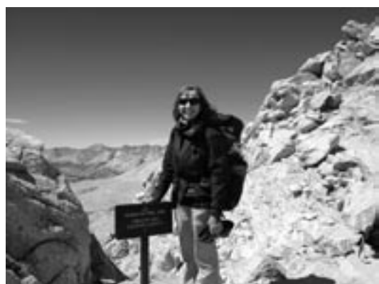
On top of Forester Pass, 13,153 feet elevation, the last before Mt. Whitney.

After the terrifying snowstorm on Pinchot, I started worrying about 13,152-foot Forester Pass. A couple from Quebec helped me get over. However, we spotted smoke as we approached the pass. Hikers coming down said they saw trees going up in flames. First snow, now fire! Concerned, we continued to get above tree line where, at least in theory, there was no fuel for a fire to burn. Amazingly, within an hour, a state fire department helicopter showed up to check out the fire. Eventually, the small blaze died down, though we could smell smoke during the night.