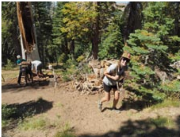
Hauling firewood up to Benson Hut.