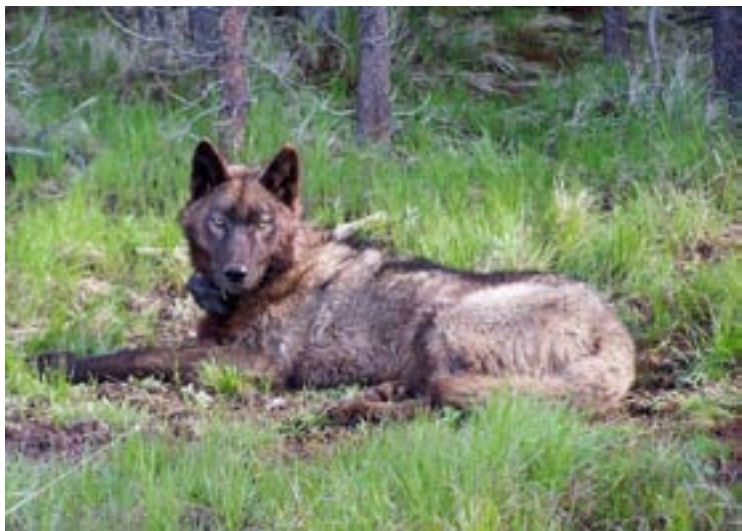
OR-25, a recent newcomer to California.

Perhaps you caught the headlines: "Death threats, new conflicts over killing of wolves" or variations on that theme. There has indeed been