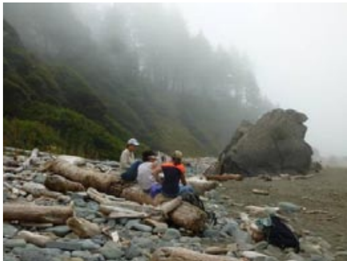
Redwood National Park hike lunch break, Hidden Beach. By Coastal Trail Leader Melinda Groom.

We will be hiking on the Hobbs-Saddler-Trestle Trails. Starting within a ridgeline swath of old growth, we soon enter maturing second-growth, descending eventually to lush creek side flats. Our trail broadly skirts the (empty) campground, fords Mill Creek, then returns upwards via switchbacks (some steep) through rugged forest to close our loop. Bring water, lunch, hiking footwear. No dogs. Class: M-6-A. Carpools: Meet 9 am Ray's Valley West parking. Trailhead 10:30 am Mill Creek Campground Rd gate (off Hwy 101, 7.6 mi N of Wilson Creek). Leader Melinda 707-668-4275 mgroomster@gmail.com Steady rain cancels.