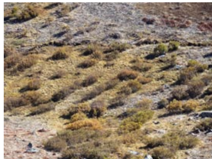
Black Meadows fragmented willow stands.

Livestock grazing on the Klamath National Forest has degraded and fragmented the large, and relatively rare, willow wetlands that provide breeding habitat for Willow Flycatchers, a