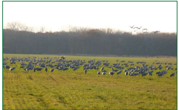
Sierra Club Sandhill Cranes Outing