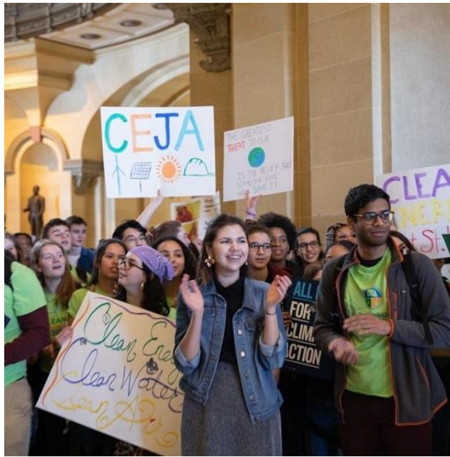
Fall of 2019 Springfield Rally, photo courtesy of Clean Jobs Coalition website