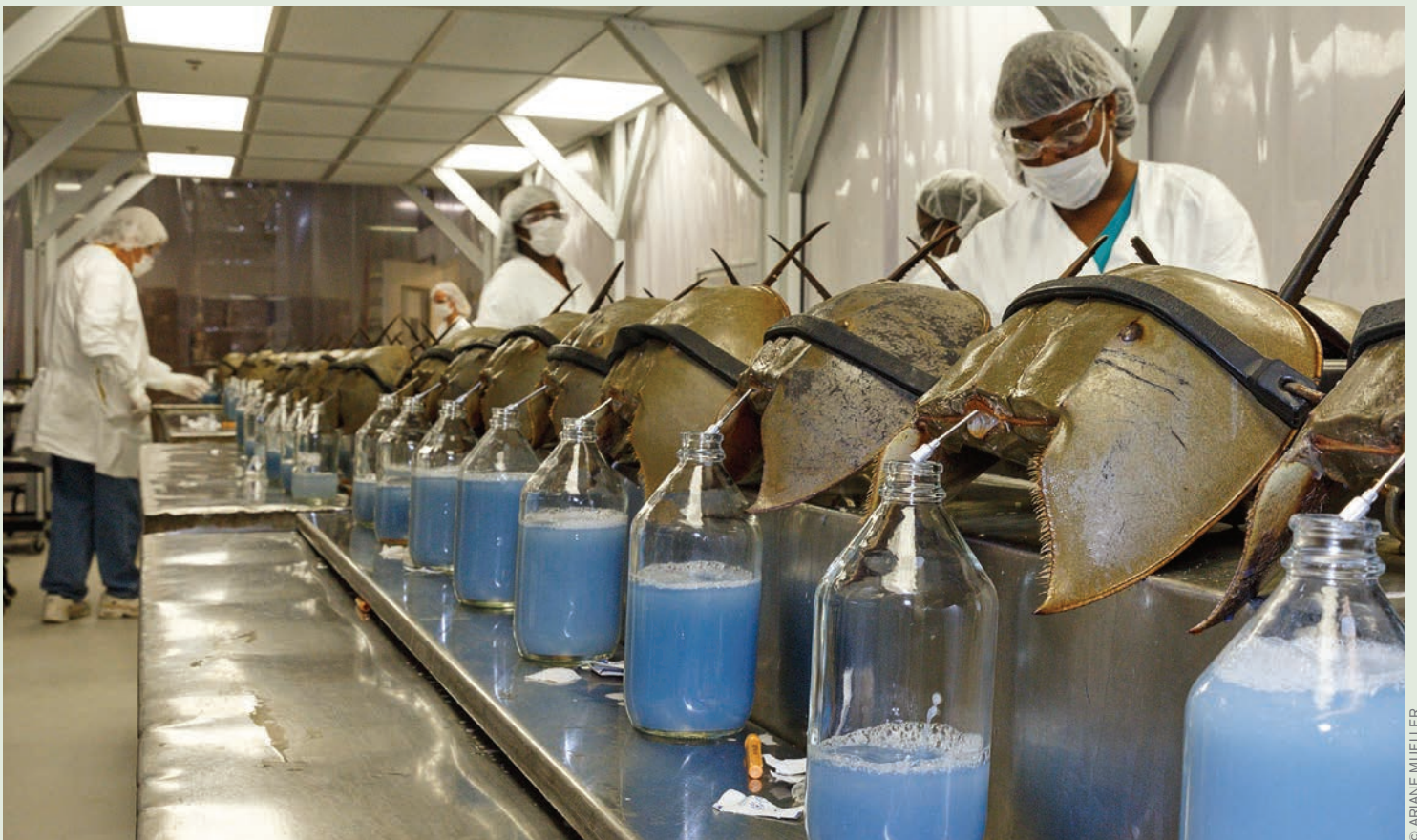
Technicians bleed horseshoe crabs at a Charles River Laboratories bleeding facility.

Under the most careful of handling conditions, roughly 22,000 crabs are likely killed per harvest season in South Carolina (ASMFC, 2019). Under a 30%