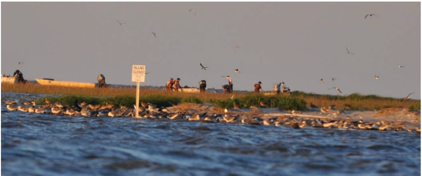
Horseshoe crab poachers work Marsh Island in Cape Romain National Wildlife Refuge.

Curtailling harvesting on all of these areas can be achieved through various procedural and substantive mechanisms, such as state-enacted closures, revisions to the horseshoe crab hand harvest permit and active oversight and policing. (See section on management suggestions, page 17).