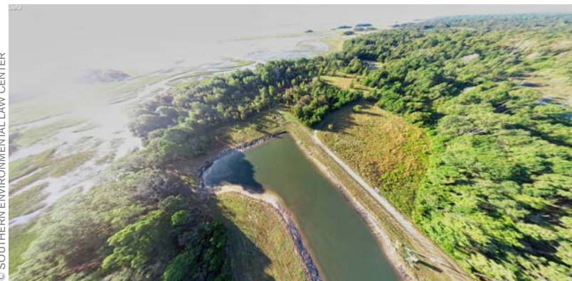
Horseshoe crabs waiting to be bled are held in containment ponds like this, a practice only South Carolina permits.

Twenty years ago, roughly 10% of harvested crabs were held in containment ponds (Wenner et al., 2002). Today,