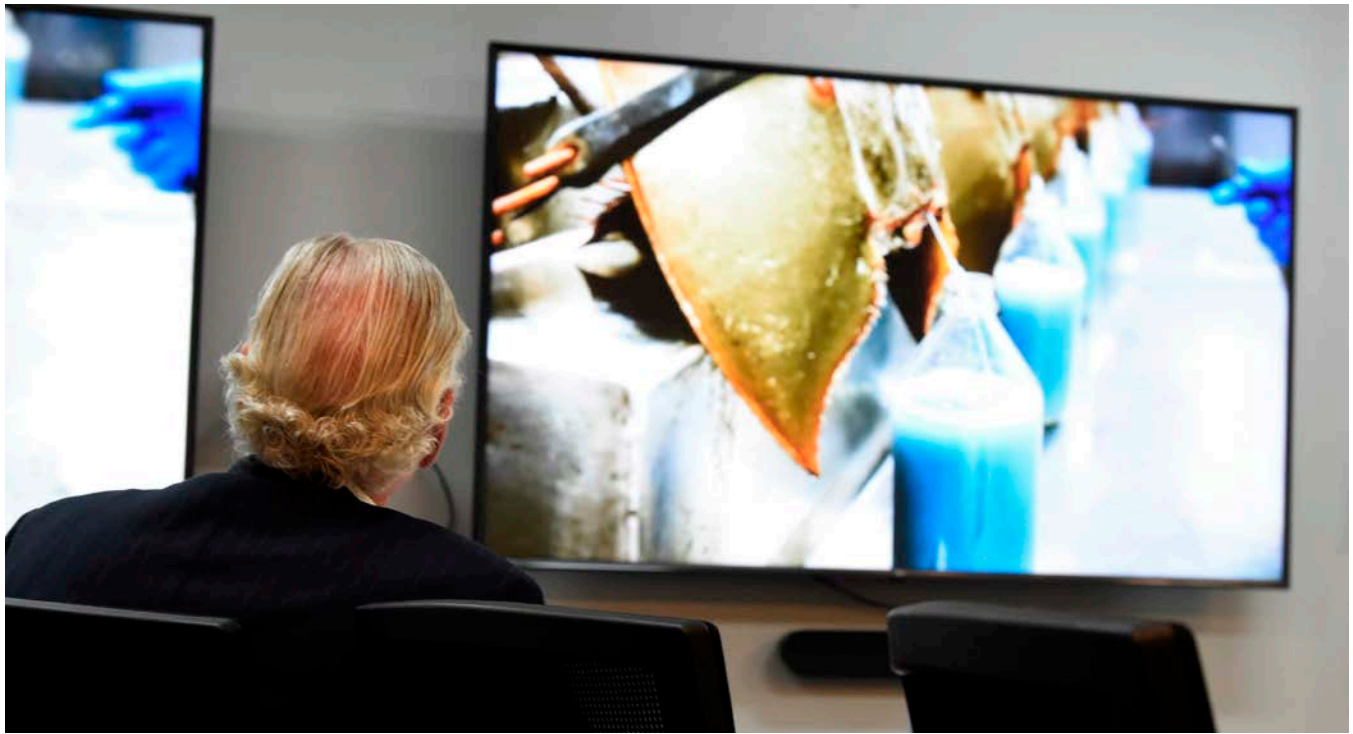
South Carolina Gov. Henry McMaster watches a video of the bleeding of horseshoe crabs during a visit to Charles River Laboratories in Charleston on August 6, 2021.