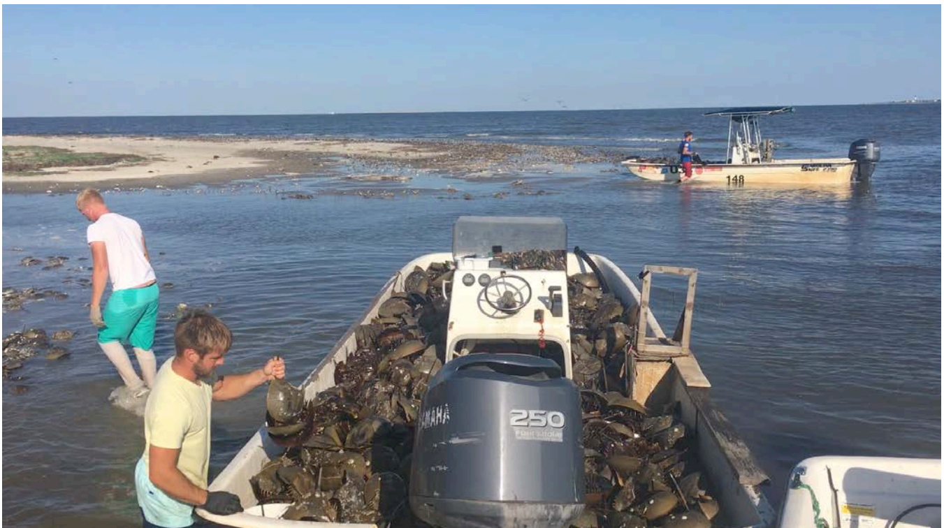
A harvester adds a horseshoe crab grabbed by the telson (tail)—a practice that can harm the crabs—to his haul.