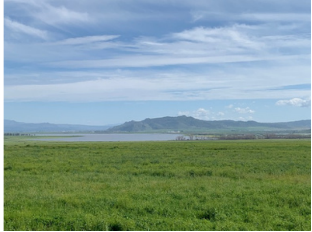
Mystic Lake, San Jacinto Wildlife Area

Cottonwood & Edgemont Warehouses (CEW): On Tuesday, May 2, 2023 our city council voted to approve the Cottonwood & Edgemont warehouse which is only 17 feet from one family home and 19 feet from another. There are other homes within 30 to 50 feet. This neighborhood is in an environmental justice (EJ) community and already is in the worse 5% of California for air and other pollutions as well as socio-economic impacts. Thanks to your donations we were able to afford the required $750 to appeal this warehouse project