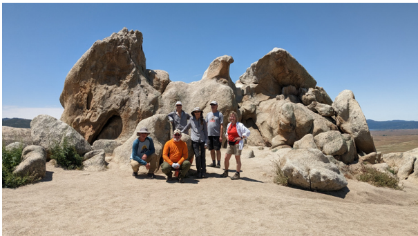
Hikers at Eagle Rock in Warren Springs

Speaking of that, our first in-person general meeting and speaker series will be on Sept. 7th at the Ron Roberts Library at 6:30pm. We haven't met since the pandemic started so we're excited to be back.