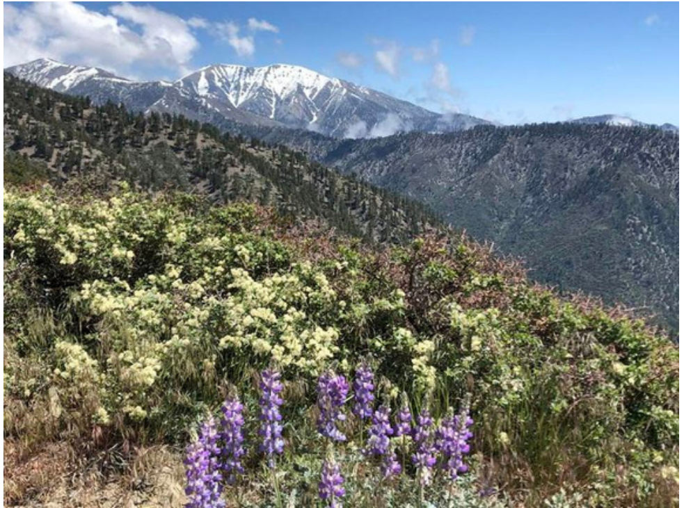
View of Mt Baldy from Inspiration Point.