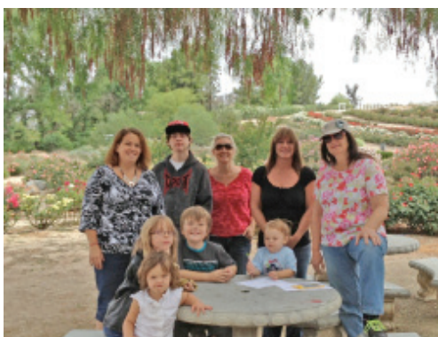
Urban Hike at Rose Haven Heritage Garden, Temecula

One of the goals of the Sierra Club is to get people outside. Our program, “Urban Hikes,” has been successful at introducing people to the idea of getting outdoors in a safe and convenient format. Our latest hike was at Rose Haven Heritage Garden in Temecula. This lovely three-acre community garden is open from dawn to dusk. It is owned and maintained by the Temecula Rose Society and provides many educational opportunities for all ages. There is a vegetable garden where local teenagers from high school and middle school work every