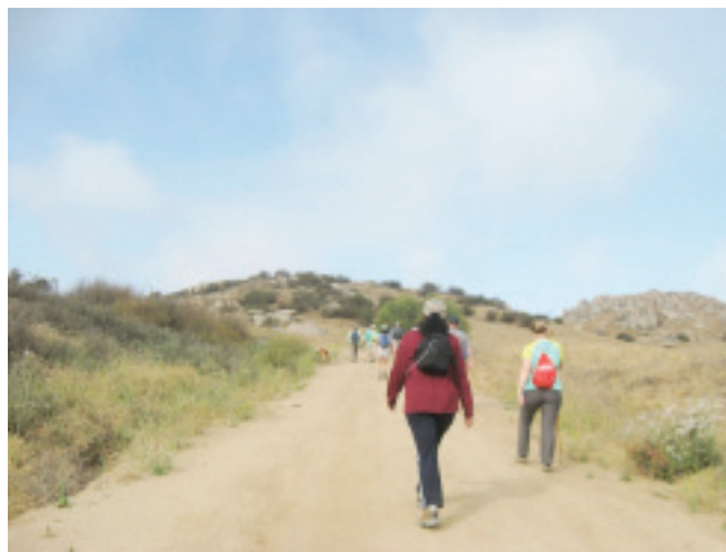
Box Springs Hike, Moreno Valley Group, May 2013

FBI, IRS, and U.S. attorney's office. Some of the warrants were under Riverside County district attorney's office. Although the warrants have not been made public, they are apparently related to a corruption