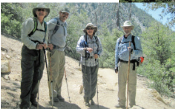
Hikers on Devil’s Slide Trail

right on South Circle Dr. Drive .1 mile then turn left on Fern Hill Rd. Proceed to the top and park where the outhouse structures are.