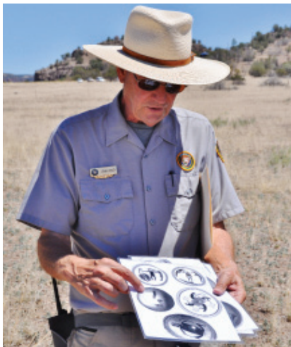
A National Park Service guide shows diagrams of 12th Century Mimbres black and white pottery during a rare tour of the large Mimbres pueblo site at Gila Cliff Dwellings National Monument.