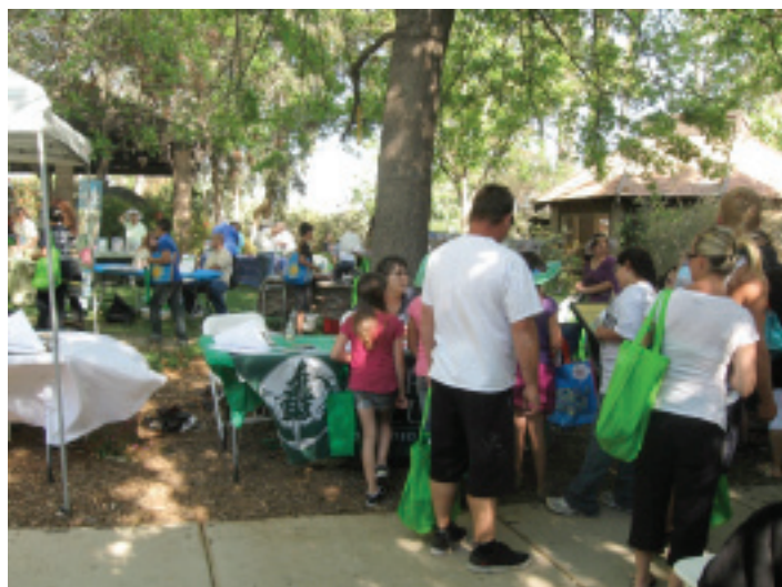
Earth Night in the Garden, April 2013