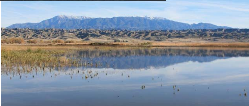
Most upper photo a scenic view of Lake Perris State Recreation Area, a good location for hiking and birding; lower photo a view of Mt. San Jacinto from the San Jacinto Wildlife Area; photo on the right is of birding at the San Jacinto Wildlife Area.