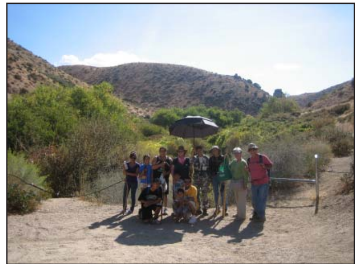
Hikers enjoy the Arrastre Waterfall (in 2004).

by Melody Nichols To encourage more to join in and get in shape, and get outside, I am starting a series of walks & hikes just for that purpose. Starting at one mile and increasing each week. The first week we will walk one mile on Mondays, Wednesdays and Saturdays (weather permitting) and increase one mile per week. You just can't say no to that! By spring, we will all be in shape to start enjoying some beautiful hikes in the surrounding areas. Meeting at the museum at 6:00 pm Monday, January (TBD). Children age 5 and up are welcome to attend. Contact Melody for more information ( labelady@msn.com ).