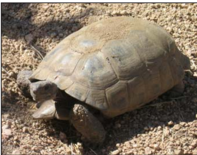
A desert tortoise found near Arrastre Waterfall (in October 2010).

I didn't think that I would ever spend much time in facebook, but numerous environmental groups are creating their page and sharing information. We hope that you will visit us there, enjoy the photos, get reminders about upcoming events and participate in the discussions.