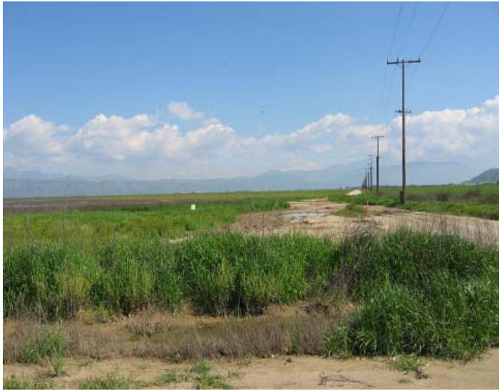
Marvin Road, the boundary between the San Jacinto Wildlife Area and the 11,350 unit Village of Lakeview Project.

As reported before, the Riverside County Board of Supervisors approved the 11,350 unit Villages of Lakeview (VOL) Specific Plan 342 at their March 23, 2010, board meeting. On April