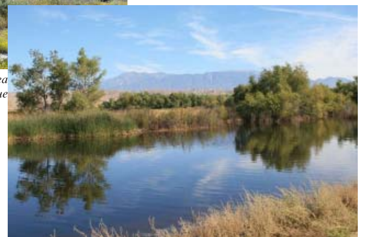
Bluebird Box Walk, San Jacinto Wildlife Area.

The Moreno Valley Group will restart group outings this fall. For more details check the chapter Calendar of Outings and the group web site at: http://sangorgonio.sierraclub.org/outings/index.html or http://