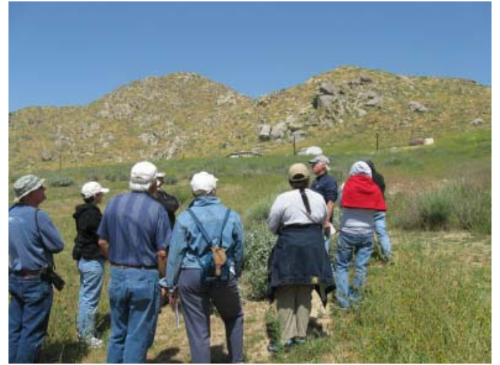
Plant Walk, San Jacinto Wildlife Area, April 2010.

mitigation for the State Water Project; it is a Stephens' Kangaroo Rat reserve for the Riverside County Habitat Conservation Agency (RCHCA); it is a cornerstone reserve in the Riverside County Multi-Species Habitat Conservation Plan (MSHCP), the reserve system which, in theory, is supposed to protect and preserve the county's endangered animals and plants. Light pollution, air pollution, at least 15,000 daily commuters impacting our roadways, damage to wildlife area lands which would harm rare and endangered plant and animal species, building next to the flood plain of the San Jacinto River, collapsible soils, loss of prime agricultural lands, availability of water, feral animals, illegal entry by residents, and the economic viability of the