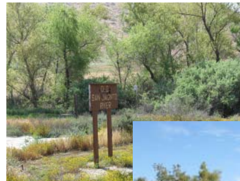
San Jacinto Wildlife Area

allow the developer to build the trail during the third and final phases of their project and require a permanent dedication of land. Unfortunately, it is not clear if the trail will ever be built. Several council members would like to change the city's general plan and eliminate that particular segment of the city's Master Plan of Multi-use Trails. Over the years the city has had many volunteers who have worked long and hard to develop the Multi-Use Trails master plan. Losing this link puts the trails system at risk.