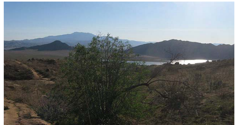
Lake Perris Skyline on Terri Peak Hike.

Due to state budget cuts Lake Perris State Recreation Area (LPSRA) will be closed on Tuesdays and Wednesdays through April 30. Please call (951) 940-5600 to confirm their hours of operation. For information on Lake Perris State Recreation Area, please check their web site at: http://www.water.ca.gov/lakeperris/ for their hours of operation and events. Information on