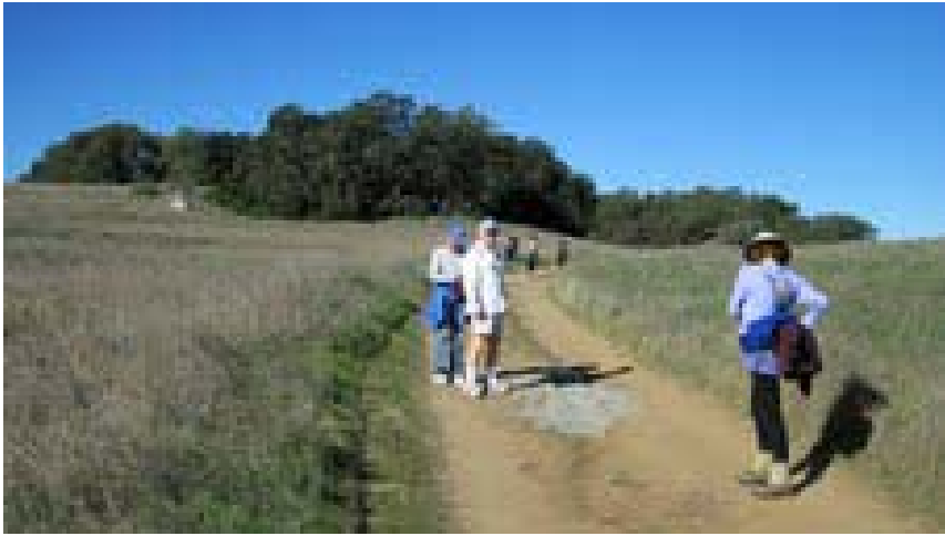
A Saturday morning trail hike on the Santa Rosa Plateau Ecological Reserve.