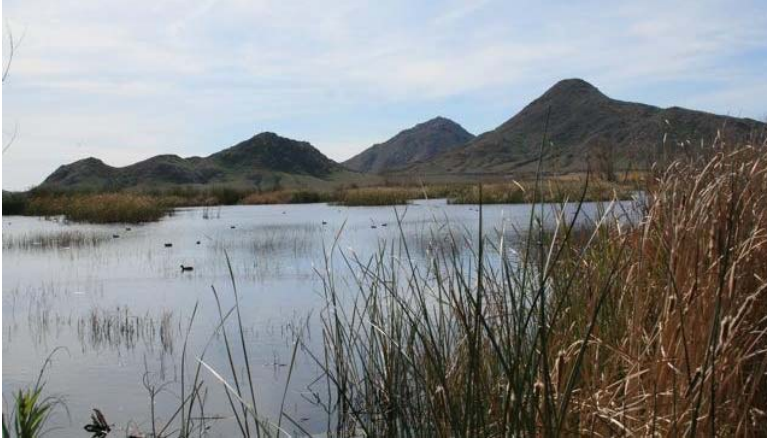
Scenic View, San Jacinto Wildlife Area.