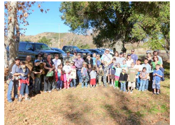
Our Outdoor Families Program gathers at the Dripping Springs Campgrounds east of Temecula.

The State Mining and Geology Board visited Lake Elsinore area again. Alberhill residents have worked hard to convince the Board that mining projects have not been managed or reclaimed properly. The City has been aided by the Board