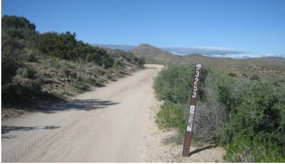
JF3253 in the Juniper Sub Region. Vehicles must stay on routes signed open.

These route designation criteria are generally known as the “ minimization criteria. ”