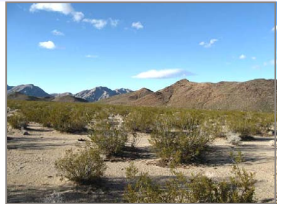
Ivanpah Valley Today

The best way to appreciate the Ivanpah Valley is to walk away from the highway into the desert. If you put your boots on the ground in