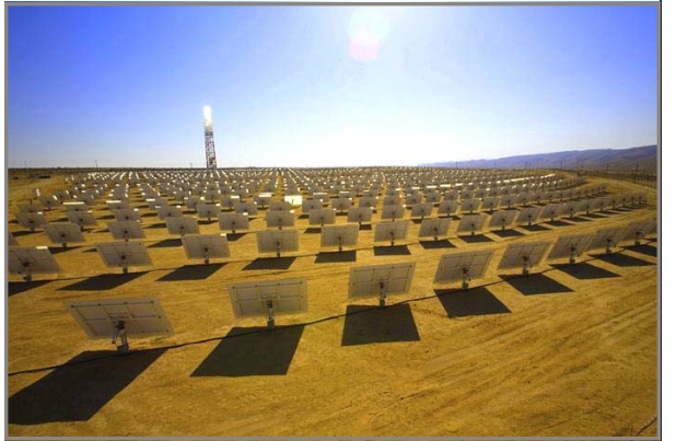
WWW.BRIGHTSOURCEENERGY.COM ISEGS Solar Thermal Power Proposal

your attention. More likely, your eye will be drawn to the 4,065 acre Ivanpah Solar Electric Generating System (ISEGS) on the northeastern slopes of the Clark Mountains. Occupying 6.4 square miles of federal land, each of its seven towers will rise 459 feet to capture reflected sunlight from 428,000 heliostat mirrors. A second solar thermal power plant will be sited on an additional 4,000 to 10,000 acres immediately adjacent to the BrightSource ISEGS. Proposed by OptiSolar, the rights to the project were recently purchased by First Solar. An upgraded 35-mile Eldorado-Ivanpah transmission line (running east to west) will transport electricity back to Nevada where it will be rerouted to California by Southern California Edison. A third set of power plants, proposed by NextLight Renewable Power for construction on lands at the foot of the Lucy Gray Mountains, will be visible on the eastern side of the Valley. The applications for the Silver State Solar Projects are for rights-of-way on 7,840 acres of public land. NextLight plans to cover some 2,900 acres with photovoltaic panels. In addition to these developments, DesertXpress hopes to construct a high-speed passenger rail line from Victorville to Las Vegas by tunneling through the mountains and running tracks along the northeastern slopes of the Clarks.