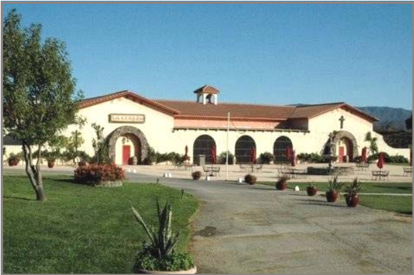
La Cereza Winery, site for our 1st Sunday Fund Raising Event

The Group Executive Committee decided that a series of wine