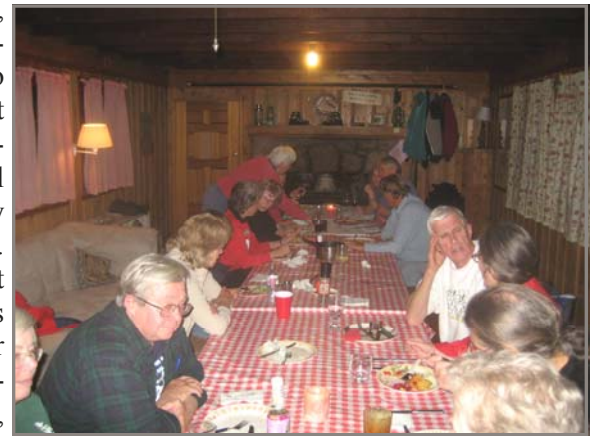
Remember to join the Mountains Group December 5-6 for our annual Holiday Celebration at Keller Hut. (See calendar for more information)

On a positive note, MG members were pleased to hear of two late September court rulings, both of which the Sierra Club was involved in, that struck down federal government management plans that endangered forest and desert habitat. In one of the decisions, a federal district court judge ruled that management plans