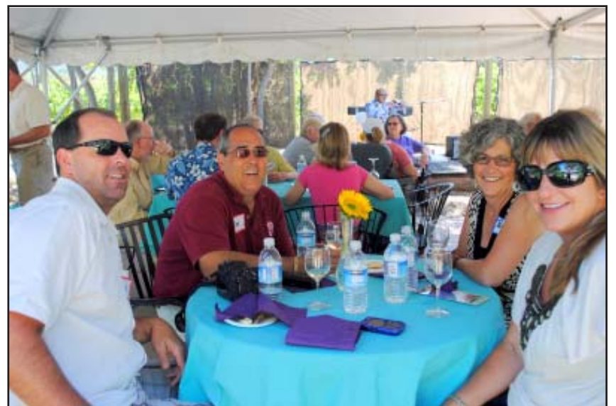
All smiles at a Sierra Sunday fundraising event at Shadow Mountain Vineyard in Warner Springs.

The second slightly non-traditional Sierra Club project we are planning is to host a candidate forum, along with the League of Women Voters, to fill three vacancies in the Temecula City Council. The forum will be held a couple of weeks before the November General Election and will be designed to give the candidates an opportunity to answer questions from representatives of the local news media, the Sierra Club, the League of Women Voters as well as from members of the audience. It should be a lively and informative event.