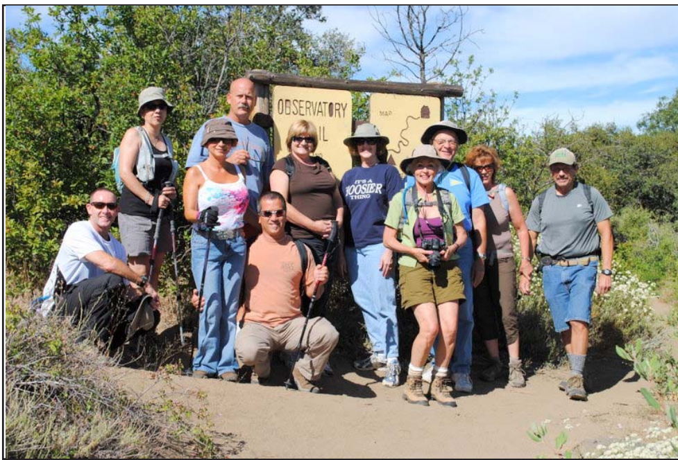
An enthusiastic group hike the mountain around Palomar Observatory followed by an Observatory tour and picnic.

We thank all the generous donors very much. Look for information on our next