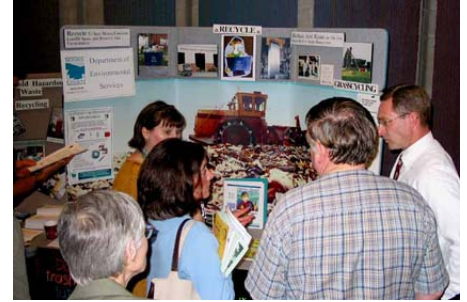
one of the 26 table displays