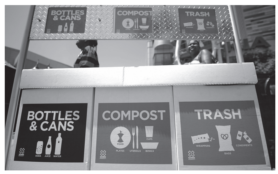
The trend has been catching on, as is evidenced by this station at the 2011 X Games.

Hors d'oeuvres and portable plates: Two concessions to the waste stream were compostable appetizer plates and optional plastic cups, for those uncomfortable carrying glasses across our uneven lawn. Unmonitored trash and recycle barrels in strategic spots led to cross contamination so I spent an hour the next morning gleaning cups and compostable plates from trash bags for our compost and blue bins. One hundred seventy guests had spent seven hours eating a full meal, drinking at an open bar, dancing the night away and I was proud to announce to the trash hauler; "just