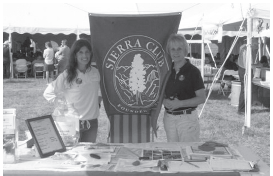
Volunteers at Ganondagan Native American Festival, July 2013

11-5. We'll be focusing on fracking and protecting our fresh water. No experience necessary—it's fun and easy, and we'll pair you with an experienced volunteer if you've never done this before. To help: 585-234-1056 or lci_msw@hotmail.com.