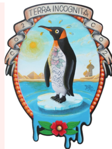
Artwork by Michiel van der Born

We know that politicians will ultimately respond to the will of the people and that the majority of people want clean energy and clean air and clean water and a stable planet. Obama was easy enough to convince. This time around, we'll need a lot more people to assert that will and make it impossible to ignore. We can do this; we can push back. You already know what to do. You've been here many times before.