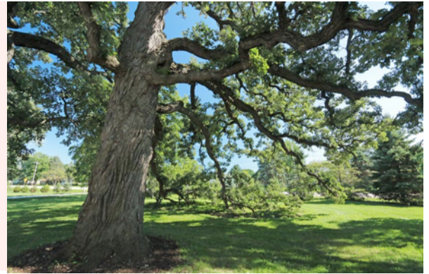
Bur Oak King