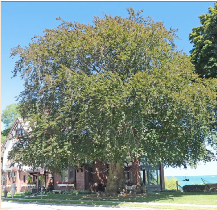
Award-winning Beech Tree, More Trees We Love on page 6

www.sierraclub.org/wisconsin/southeast-gateway