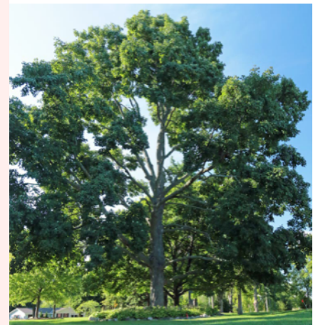
Matriarch Sugar Maple

Nomination forms were designed and distributed, an ad hoc committee was formed and we were thrilled to