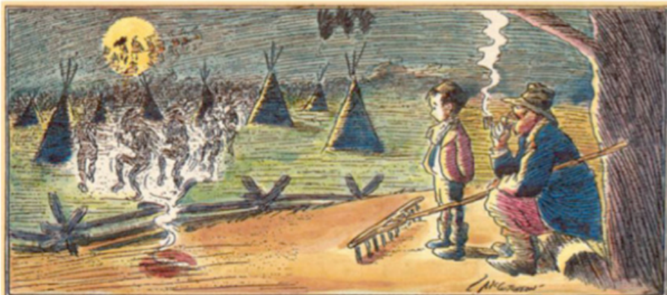
John T. McCutcheon's Injun Summer , Chicago Tribune, Sept. 30, 1907