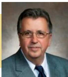
Representative Tod Ohnstad State Assembly District 65 (Kenosha)