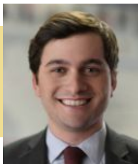
Representative Tip McGuire State Assembly District 64 (Somers)