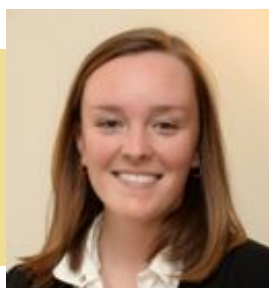
Representative Greta Neubauer State Assembly District 66 (Racine)