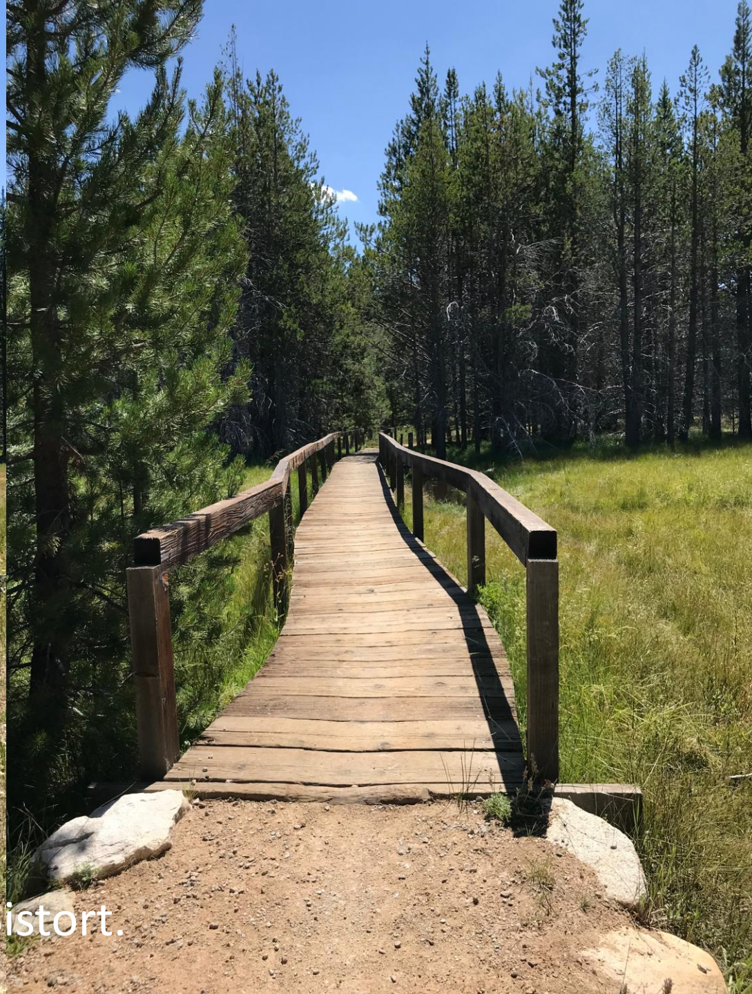
A couple of bridges cross wet meadows of Bistort.