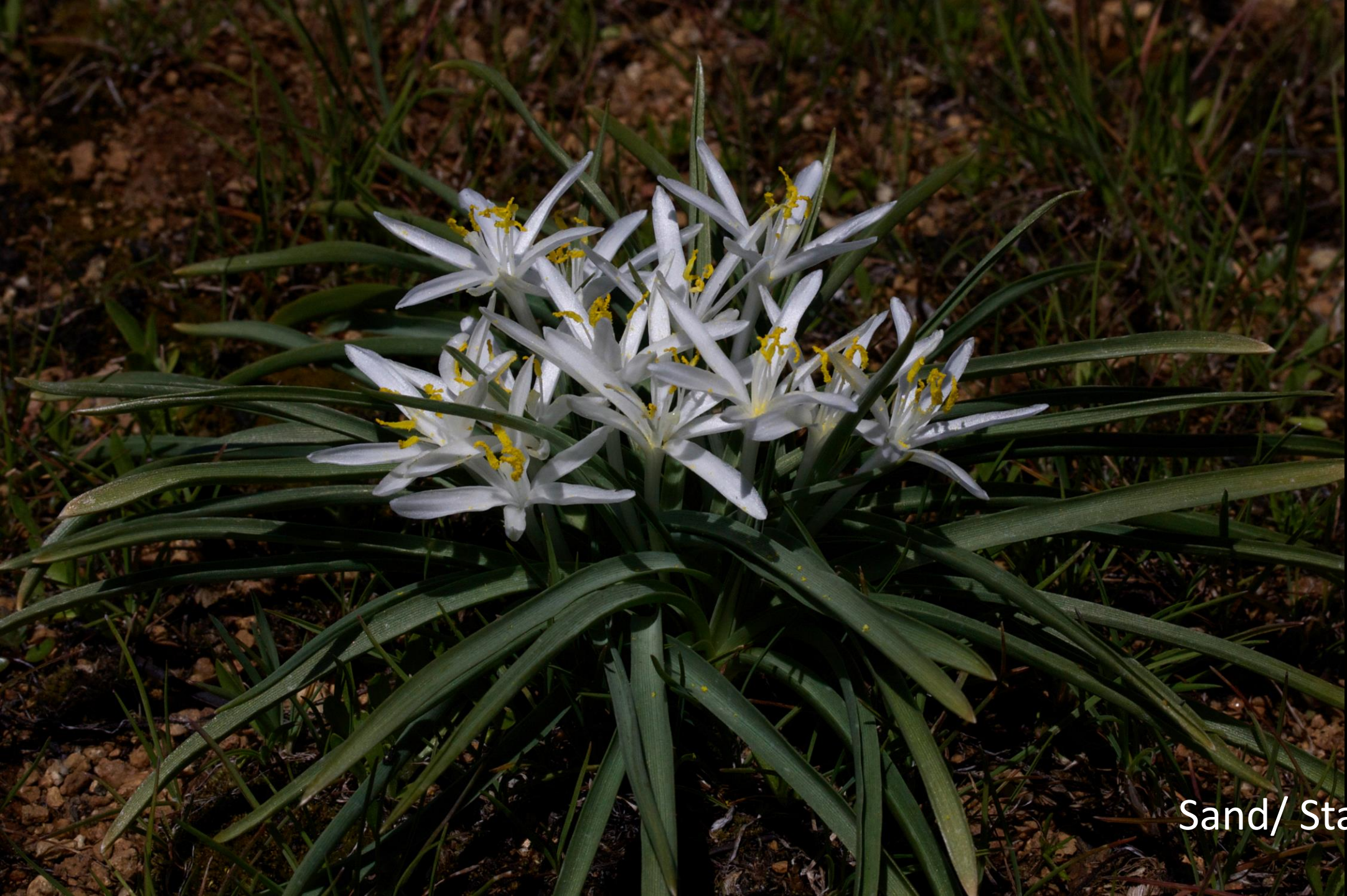
Sand/ Star Lily