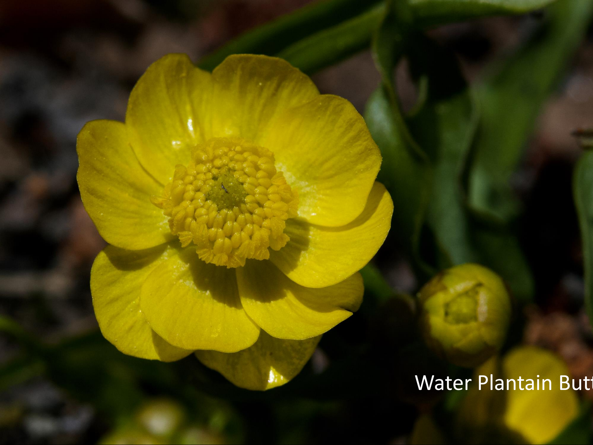
Water Plantain Buttercup