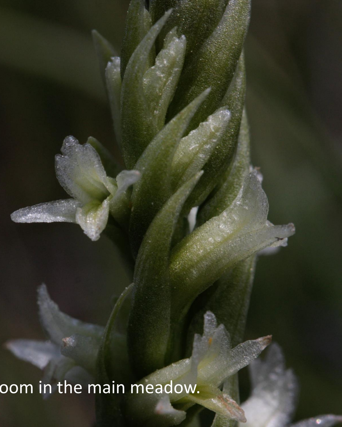
Ladies' Tresses are one of the last wildflowers to bloom in the main meadow.