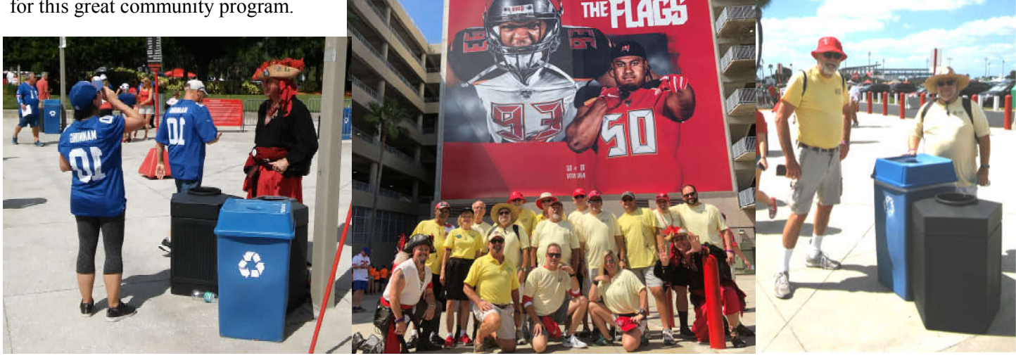
Sierra Club/Tampa Bay Group