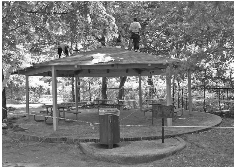
The picnic gazebo at Rozelle-Annesdale Park gets a new roof.