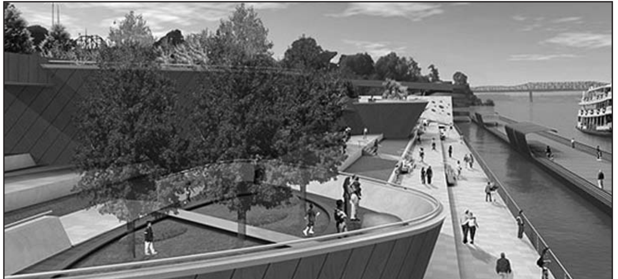
ABOVE: Project for Public Spaces stated: "[Beale Steet Landing] seems to be a design that nobody will want and—worse-- nobody will use." The project was designed by architects from Argentina and includes pods that will, at times, be under the River. Artwork submitted by Sue Williams.

The project destroys wetlands, and the specified mitigation is not within the same hydrologic system but, after Sierra Club's protest, was moved from the Loosehatchie River to the Wolf River in Fayette County—still miles away. (see also http://www.sierraclub.org/policy/conservation/wetlands.asp )