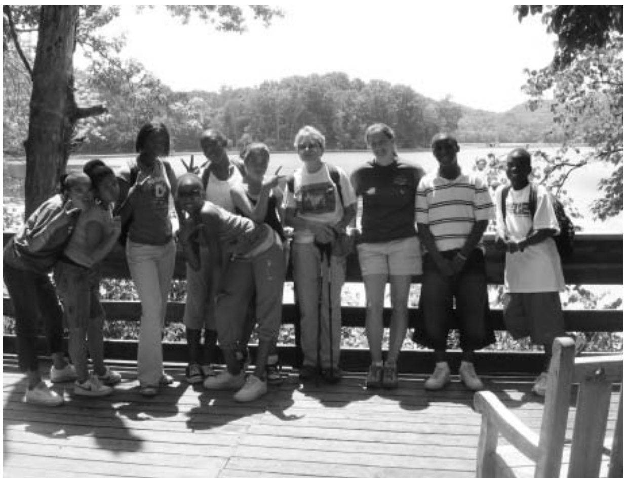
Children from the Metro East Community Center pose with Inner City Outings hike leaders in front of Radnor Lake.

To subscribe to the Tennessee News Listserve, email the following text to