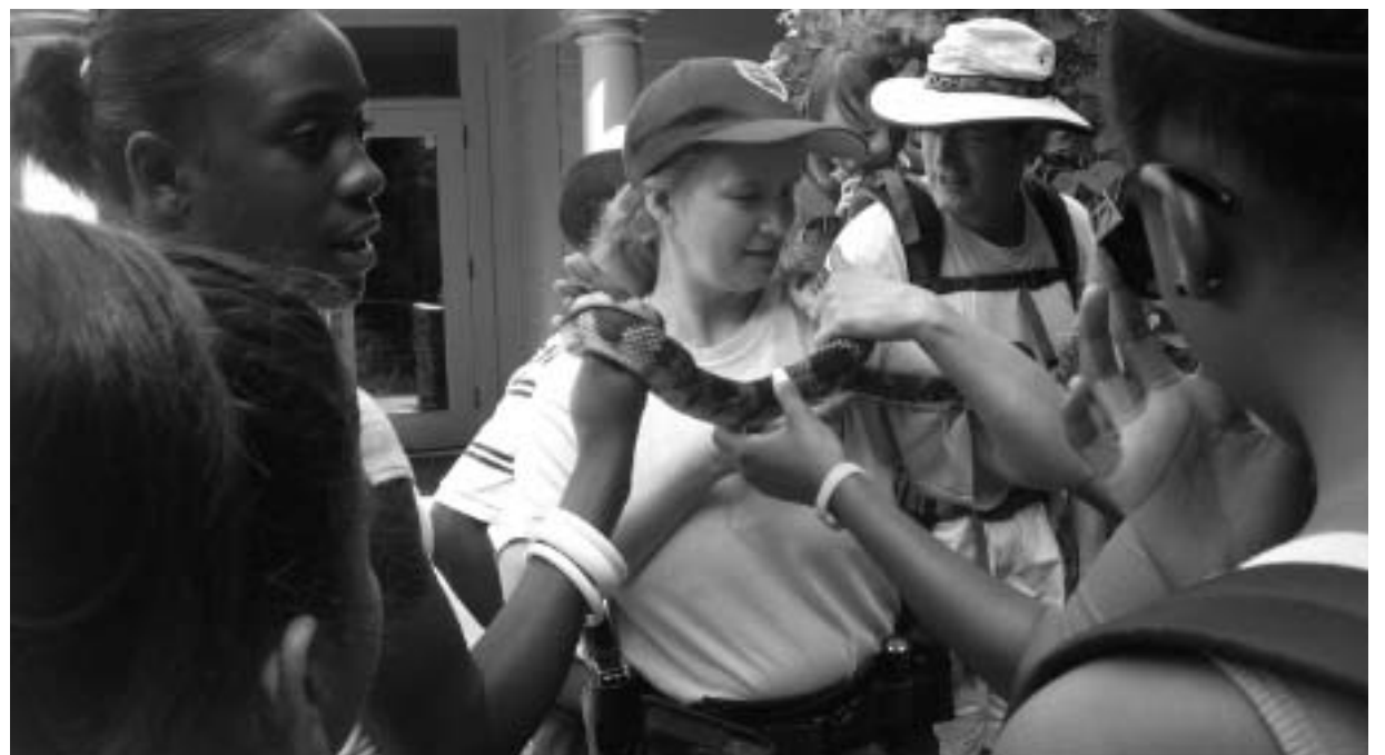
Kids from the Metro East Community Center learn about the natural world during an Inner City Outing. Read more on page 3.

It's that simple. Do it now for yourself, your family, your community, your Tennessee Chapter Sierra Club!