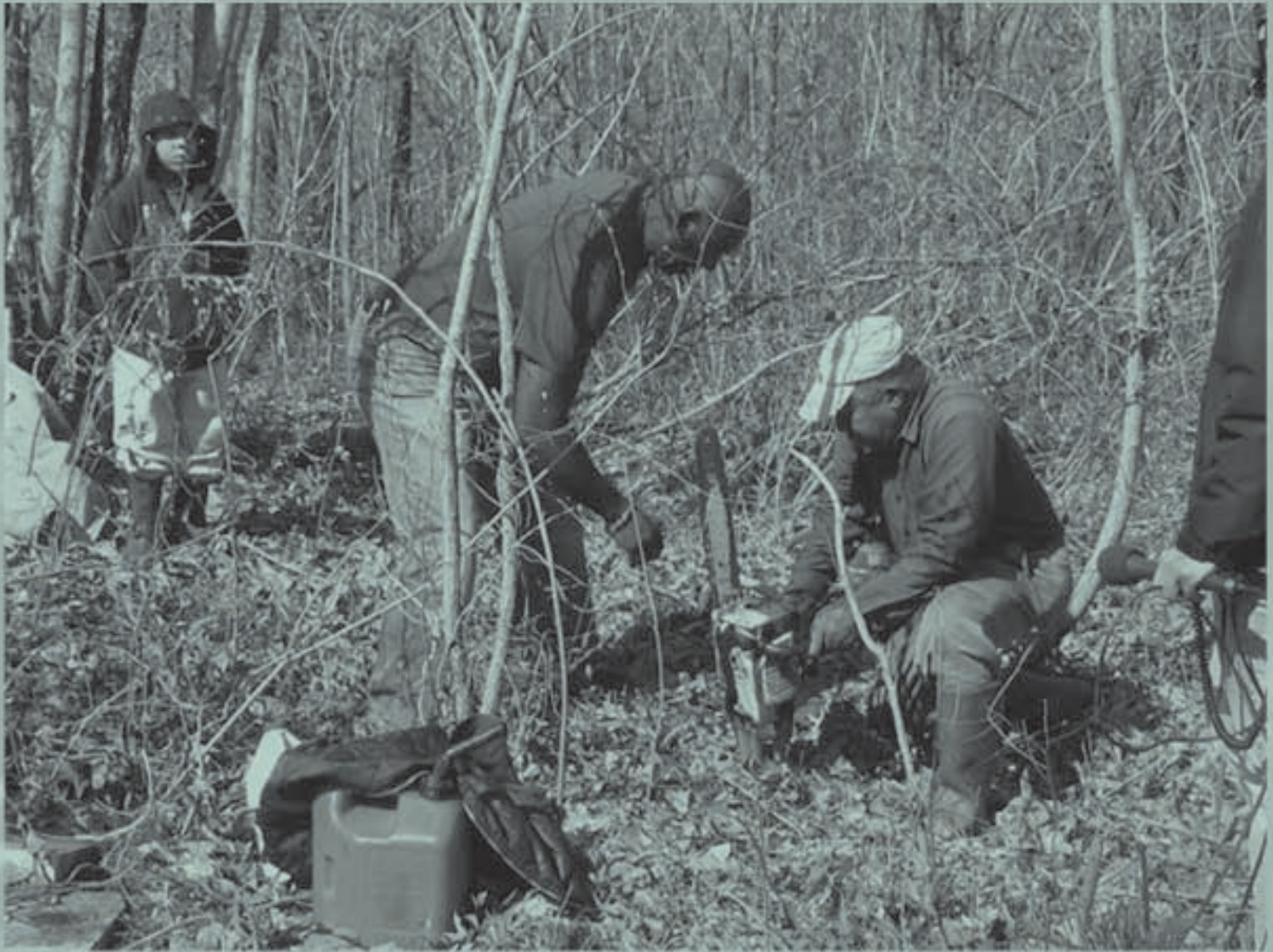
Volunteers from the Sierra Club, Fredonia community and Memphis begin the process of cleaning up the historic Fredonia cemetery.