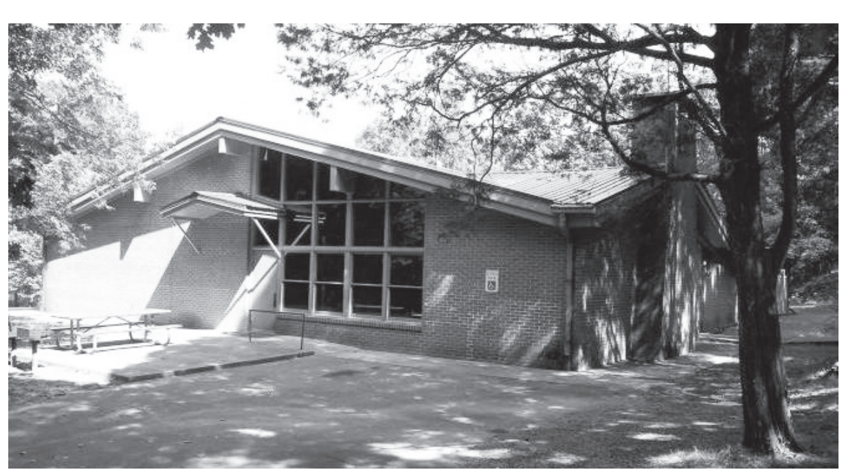
When you arrive at the TN Chapter Summer Retreat get acquainted with other participants and plan to enjoy the night sky. The Group Lodge includes two air conditioned bunkhouse wings each with 19 twin size bunk beds, restroom and shower accommodations.

During the TN Chapter Summer Retreat join us to explore the Red Cedar Forest and Glades, approximately 15 miles east of Nashville, located in the southern part of Wilson County. This forest originated from the Resettlement Administration Program in 1935. TN Dept. of Agriculture, Forestry Division assumed responsibility for the Forest in 1955. Before purchase by the Resettlement Administration, numerous landowners with small acreage held the land. Land use was for row crops, pasture and forests. The Forest is of Natural Heritage significance because it is part of the largest contiguous cedar glade-barren complex in public ownership in middle Tennessee. Part of the Forest is designated a Tennessee Natural Resource Area and contains nineteen rare and endangered species (1,034 acres), Cedars of Lebanon State Park (831 acres) and several in-holdings (304 acres), cemeteries and caves. Eastern red cedar is the predominant species and is found in pure stands on poor soils. On deeper soils it is found mixed in with hardwoods.