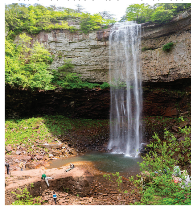
Fall Creek Falls

Nature had ideas of its own for our Sat-