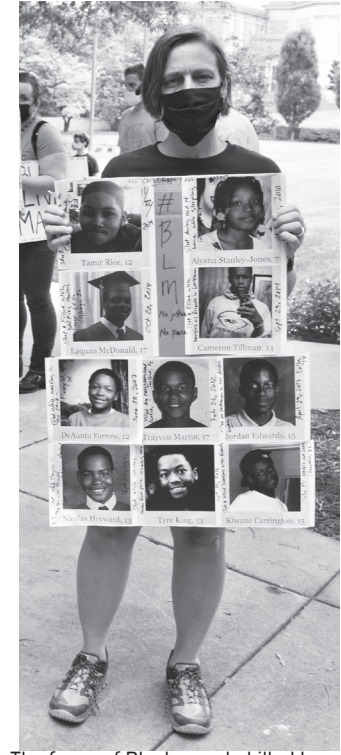
The faces of Black people killed by police are displayed at a vigil for George Floyd on June 8 in Knoxville,