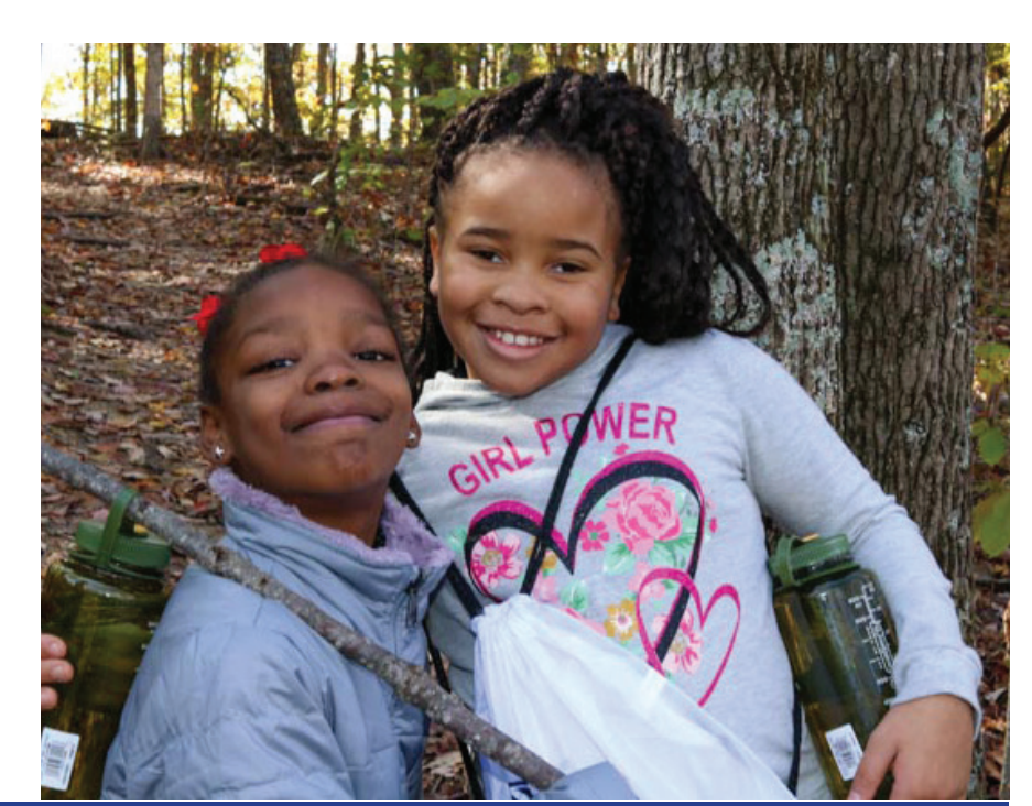
Page 4 - July / August 2020 The Tennes-Sierran