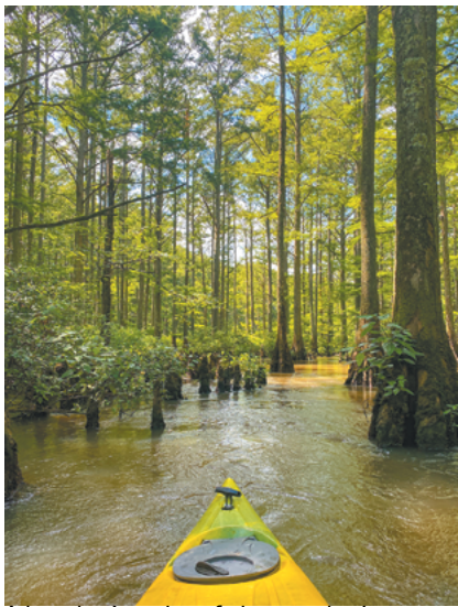
A kayaker's point of view on the Lost Swamp Trail.

The Wolf River is perhaps the best-kept natural secret anywhere in the great State of Tennessee. Having paddled every linear foot of the Wolf River — from its humble origins in the Fabled Headwaters Region in Ashland Mississippi, all the way to the