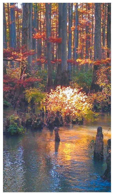
A sunbeam strikes a sweetspire bush in full fall foliage.