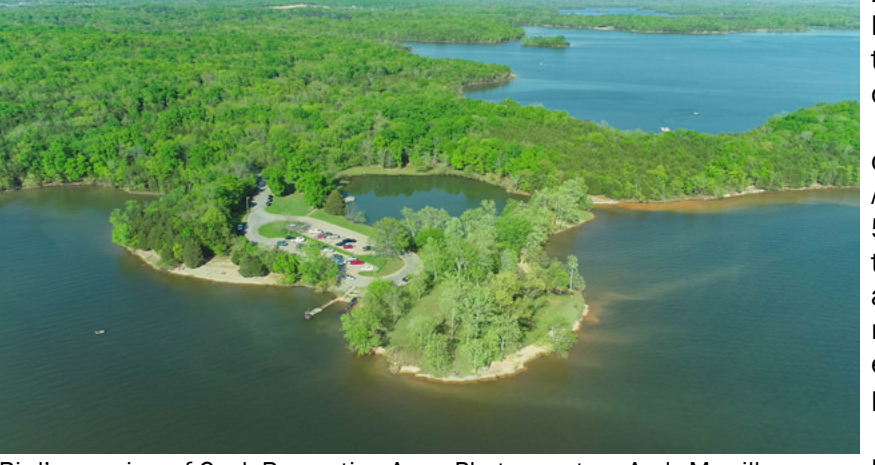
Bird's eye view of Cook Recreation Area.

and would disturb the current natural ecosystem.