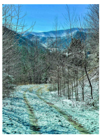
The beauty of winter is apparent on the 150 acres being acquired by Roan Mountain State Park.

The purchase also has historic significance. In October of 1780, a group of men residing in the Appalachian highlands decided to take up arms against the British during the American colonies' war for independence. Starting at Sycamore Shoals in what is now Tennessee and going some 330 miles "over the mountain," these men picked up supporters along the way until they were a force of some 1,000. Their victory in the Battle of Kings Mountain is considered by historians to be the turning point in the American Revolution, and this new addition to Roan Mountain State Park includes a portion of their route. Says Michelle Pugliese, Land Protection Director for the Southern Appalachian Highlands Conservancy, "I can just imagine the Over- mountain Men on their way to (their)... battle at