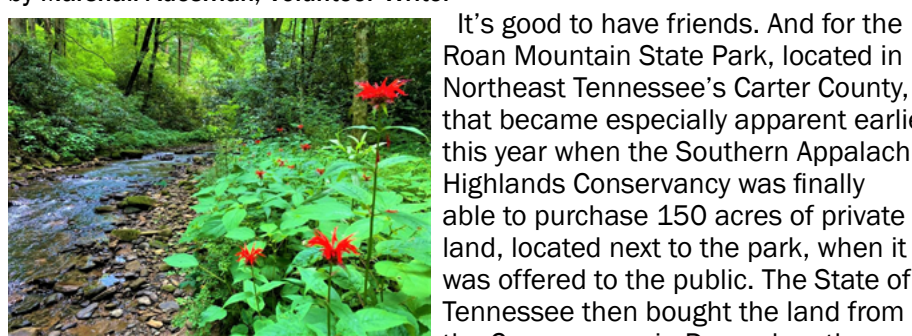
Bee balm growing on Heaton Creek in Roan Mountain State Park.