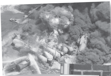
ABOVE: Oil train explosions in Canada: Lac Megantic, Que. July 6, 2013