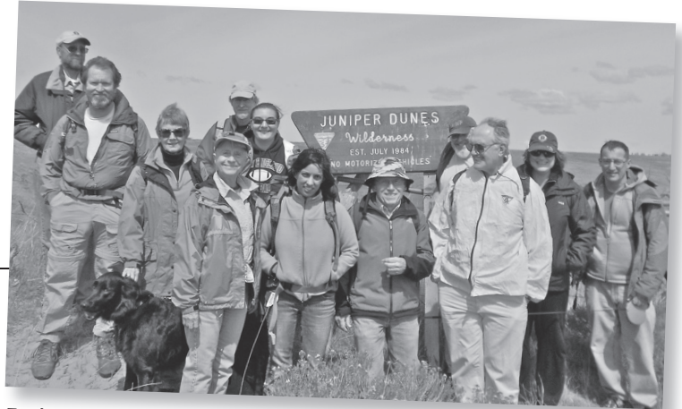
Explore - Enjoy - Protect. In April, local family farmers led us on a magical hike in the Juniper Dunes Wilderness, and then nearby to Easterday's new 30,000 cattle "finishing" feedlot supplying Tyson's slaughterhouse near Pasco. A loophole allows industrial stock operations to pump vast volumes of ancient groundwater, threatening the family farmers' domestic wells.

DISHMAN HILLS CONSERVATION AREA - GLENROSE This hike will focus on the Glenrose area about 2 miles east of Ferris High School – wildlands protected in 2012 using Conservation Futures funds. The hike is easy to access from the urban South Hill