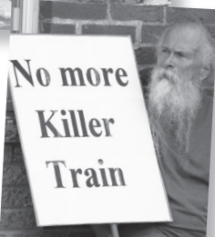
RIGHT: Response to the Rail Company CEO.

Sierra Club's advocacy to stop coal trains has renewed concerns about public health and safety locally – and globally, with coal accelerating climate change. Now, proposals are underway to expand oil exports – and more oil trains.