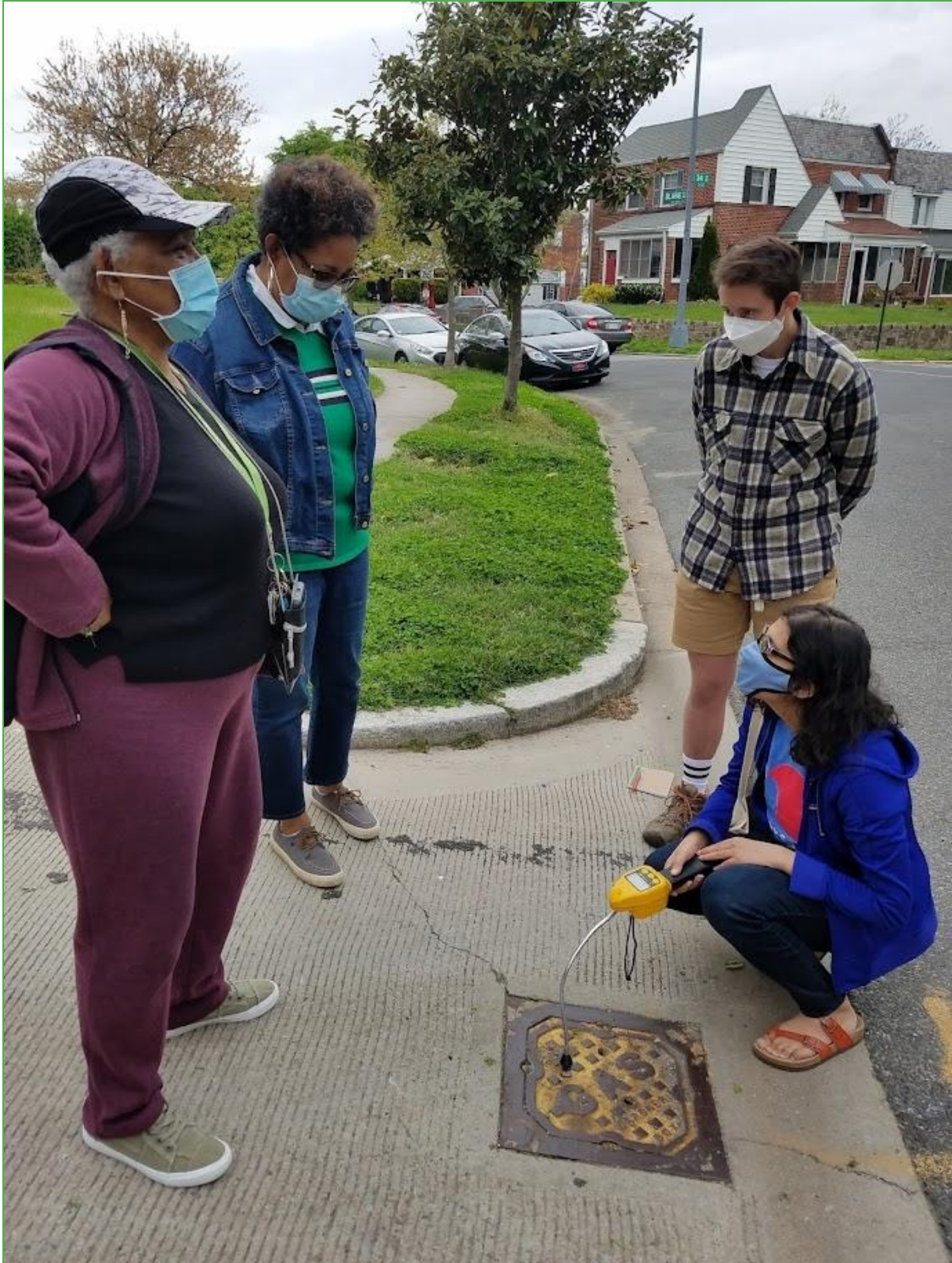
Partners from Audubon Naturalist Society and Washington Interfaith Network talk with community members as they measure neighborhood gas leaks