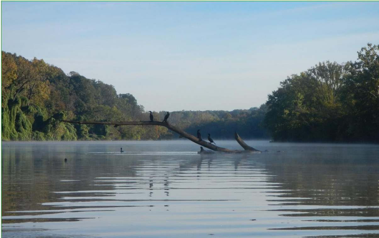
Cormorants at Watts Branch. Arboretum to left (west bank)