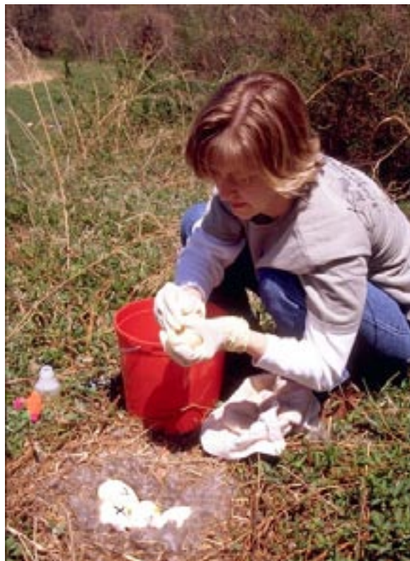
A volunteer for the Humane Society of the United States oils Canada goose eggs to limit flock growth.

I visit goose-attractive sites in Montgomery County each spring to limit the number of goslings hatched by using "goose birth control." Our volunteer team interrupts egg development by addling, which means coating eggs with corn oil to prevent air exchange through the shell, or by simply removing them