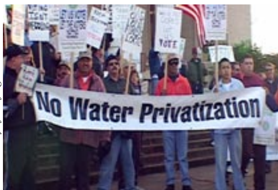
A protest against water privatization, from the film "Thirst," to be screened March 15 at the Woodrow Wilson International Center for Scholars.