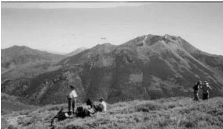
Participants on a Sierra Club national activist outing to Nevada enjoy broad views on the Toiyabe Crest trail.

In 2006, four Wild Legacy activist adventures await you: