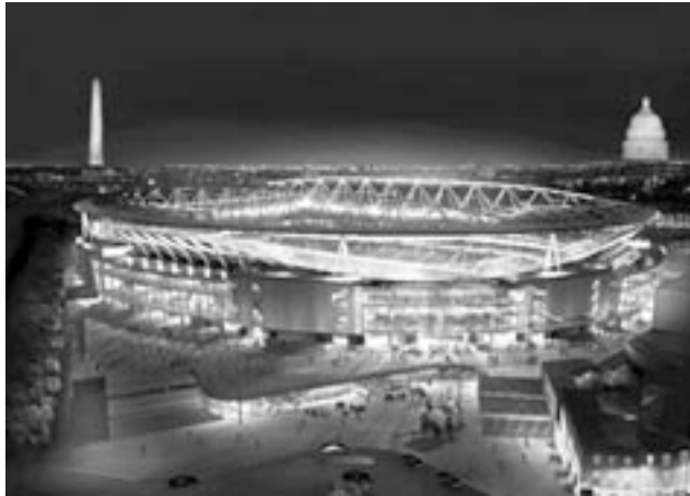
Rendering of new ballpark.