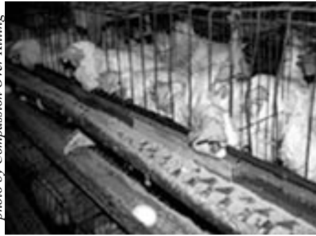
Up to 10 hens are crowded into each battery cage in conventional egg production.