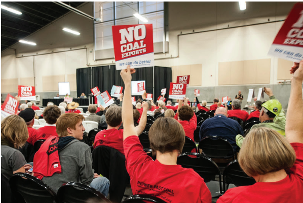
Longview hearing