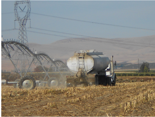
Applying manure in the fields by tanker truck and irrigation sprinkler.

Between 10 and 20 percent of private wells have nitrate concentrations that exceed national and state drinking water standards, according to EPA. As reported by the Yakima Herald, low-income residents are forced to choose between buying expensive filters, bottled water, or drinking polluted water from wells (“Hidden Wells, Dirty Water: Evidence of ground-water contamination in the Lower Valley has been ignored for years, leaving poor rural residents exposed to health risks and nowhere to turn,” June 29, 2009.)