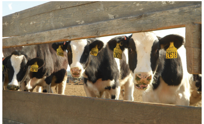
Most factory farm cows are never on grass.