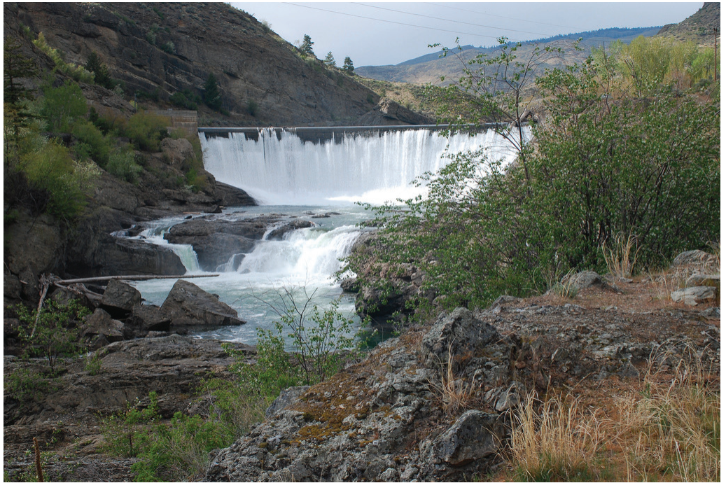
Caption: Similkameen Falls (foreground) and Enloe Dam. Sierra Club and other members of the Hydropower Reform Coalition won a victory when the state's environmental court ordered the Department of Ecology to conduct a new aesthetic flow study if and when the Okanogan PUD ultimately builds its economically troubled Enloe Dam project.

The Board rejected Spokane County's claim that its participation in a Regional Toxics Task Force augmented the toothless permit. The Board found that the Task Force is not a substitute for legal restrictions on quantities, rates, and concentrations of PCBs being discharged from point sources into the Spokane River. The Board underscored