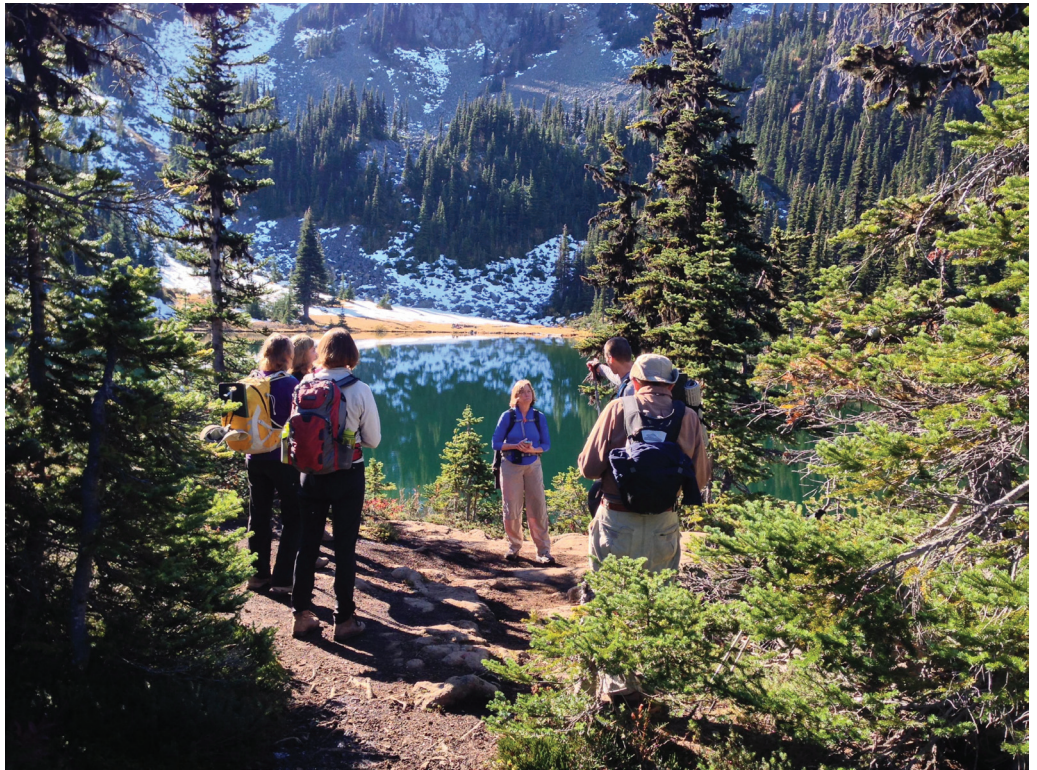
Mid-October hike to Sliver Lake in the Olympic Mountains on a North Olympic Group hike to showcase areas proposed for wilderness designation via the Wild Olympics Campaign.

If history provides any lesson, it's that the struggle to