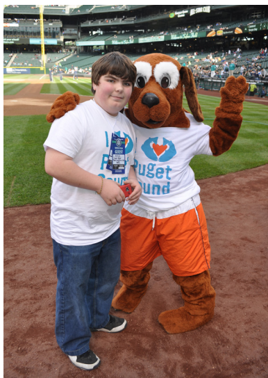
Puget Sound Starts Here Mariners Game 2013.

Not only will you enjoy the game, you will get a free themed t-shirt, you can visit the PSSH booth for games and prizes, and each ticket holder will get to hold up “K cards” at periodic moments in the game. When all of the individual K cards are held up together they will make an image of a giant Puget Sound creature