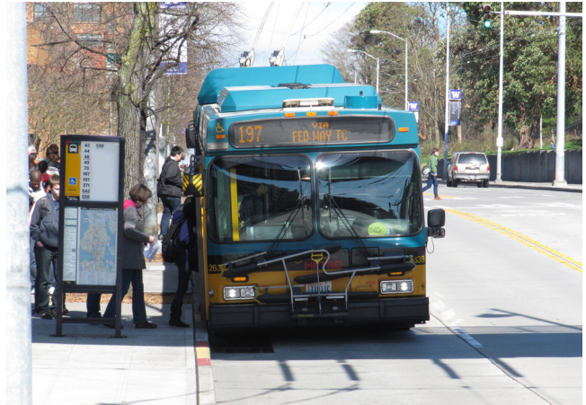
Metro bus.