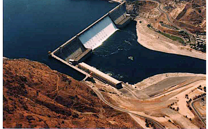
The Columbia River and Grand Coulee Dam. This dam is the fifth largest in the world, and blocked salmon from returning to the Upper Columbia River. The United States and Canada are considering adding “ecosystem function” to the Columbia River Treaty – enabling the return of salmon to ancestral spawning waters and restoring native fisheries.

Next, people who lived through the dam-building era will describe epic losses suffered in the Columbia Basin.