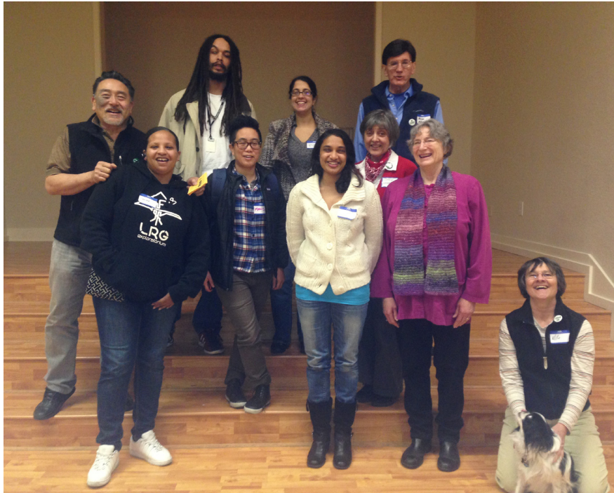
Got Green and Sierra Club at messaging training to learn how to speak to other organizations and business about our efforts on Targeted Local Hire.