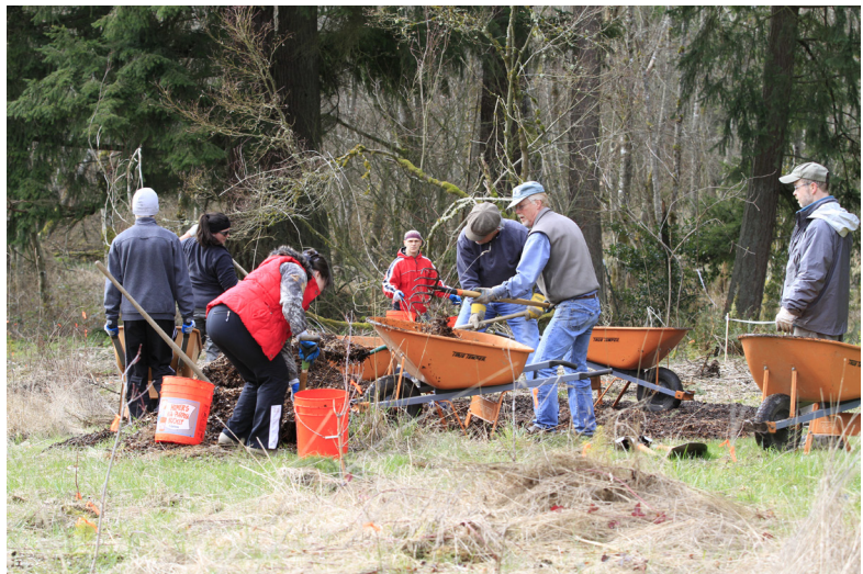
Spreading mulch around newly planted shrubs at Soos Creek.

others just wanting to do some good work to benefit the environment.