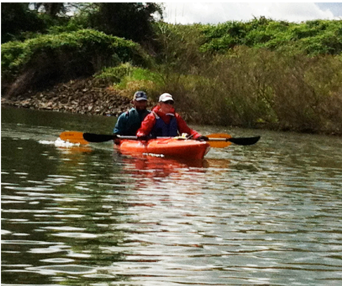
Kayak Trip.