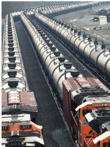
Crude Oil Trains at Delta Yard, Everett, WA.