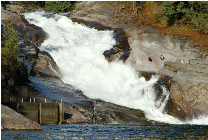
Sunset Falls.

From the cascading waters of Wallace Falls to the snowy slopes at Stevens Pass, the North Cascades contain some of Washington's most cherished natural playgrounds and scenic vistas. With well over 300 glaciers and more than 1,600 species of plants and other organisms, this region is not only a recreational paradise, but also a bastion for ecology and biodiversity.