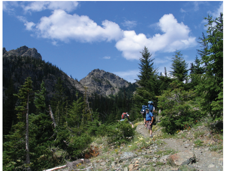
Esmerelda Basin.

Look at the Sierra Club's proposal to give the highest level of protection for these marvelous places, with habitat for endangered species including wolverine denning habitat and old-growth forests for spotted owls,