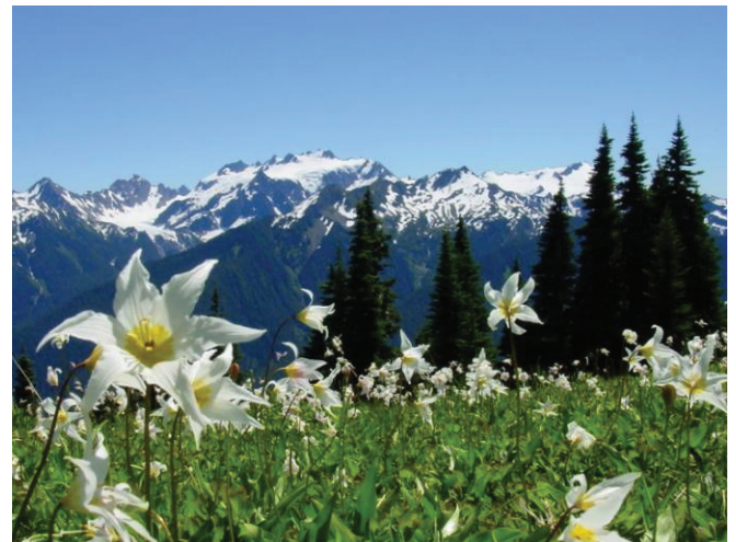
Olympic National Park.

Up to 10 miles, moderate. This remarkable area is home to one of the most extensive blocks of ancient rain forest not already protected by wilderness designation in the lower 48 states. Learn about ancient Douglas fir, Sitka spruce and western red cedar trees, sometimes topping out at 300 feet and supporting girths of nine feet or more. This is the second hike showcasing the importance of the Wild Olympics proposal. Located on the west side of the Peninsula, participants may wish to spend the weekend at the historic Quinault Lodge or to camp at nearby Park Service campgrounds. RSVP to ExploreOlympics@gmail.com.