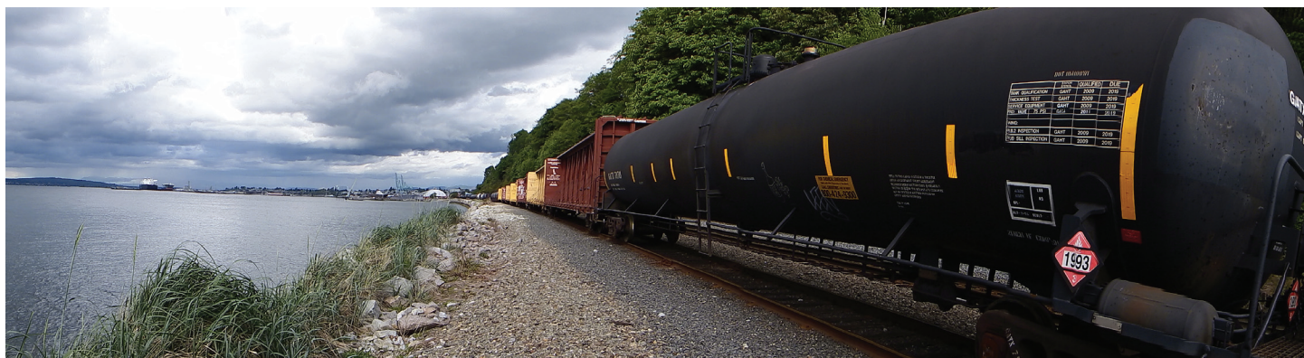
Oil train near Howarth Park, Everett, WA.