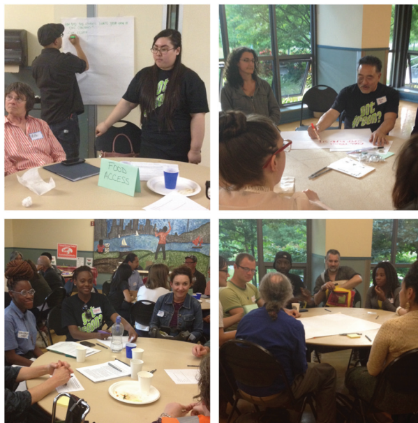
Participants at recent Environmental Justice event in Seattle.