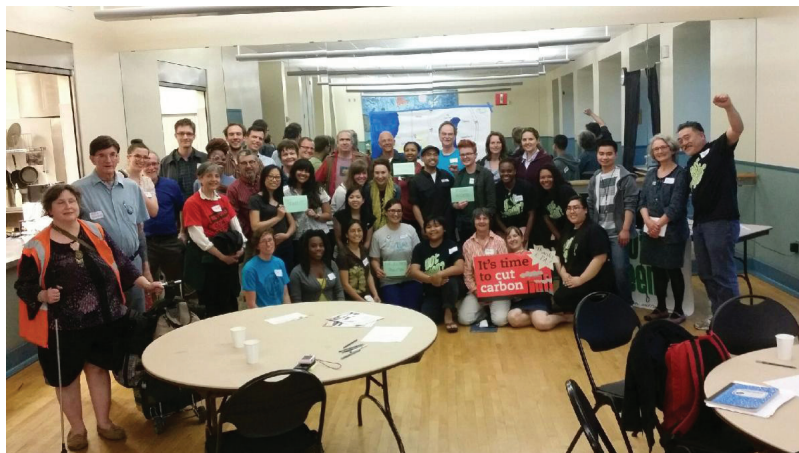
Participants at recent Environmental Justice event in Seattle.