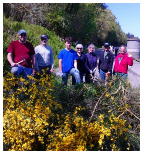
Work party to remove invasive species.

In some places along the creek bed, the Scotch broom has grown so thick it has overtaken both native prairie plants and riparian vegetation. Now with a new moniker, the Legion of Broom aims to gradually remove the Scotch broom using tools known as weed wrenches, which have been provided by Pierce County Parks to facilitate the restoration of the prairie.