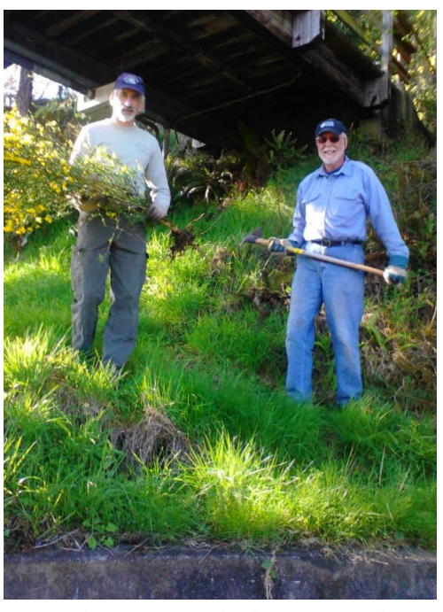
Getting the invasives out!