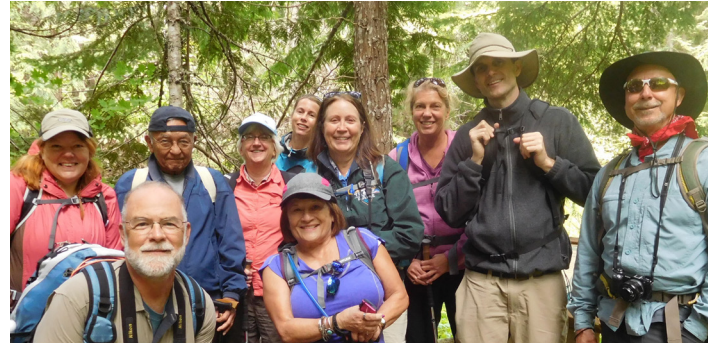
"Iron Goat Trail "