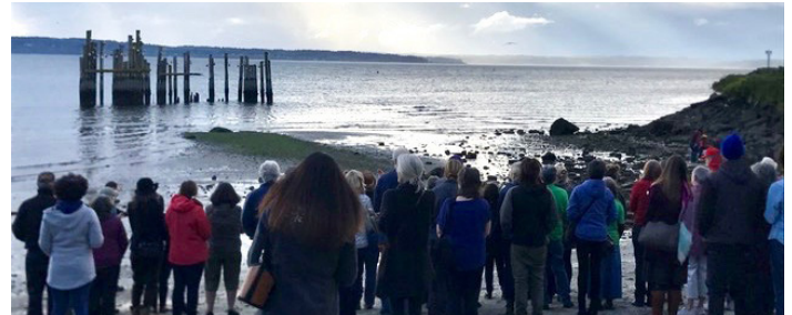
"Lummi Water Blessing"

These events help elevate attention for the Kinder Morgan project. We will be following up with folks interested in volunteering and will continue to stand with First Nations on Pull Together projects throughout the Puget Sound region. Pull Together events are ongoing in the Seattle area, with our partners at 350 Seattle! ( fundraise.ravenrust.com/pulltogetherSeattle )