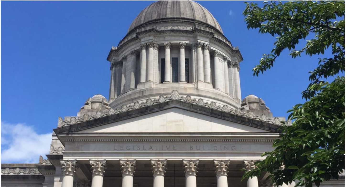
"State Legislative Building"