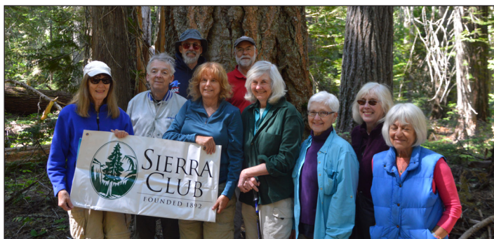
Group outing to Bumping Lake

Outings for Southwest Washington are posted on: www.meetup.com/portland-vancouver-sierra-club-outings-events Questions? Email Lehman Holder, tripsguy@aol.com